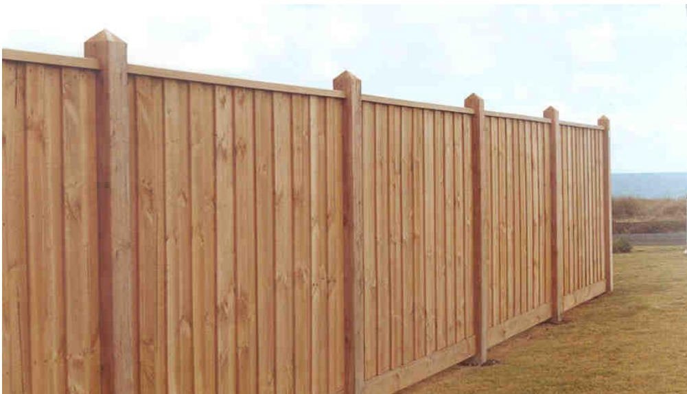
Photograph showing fencing required