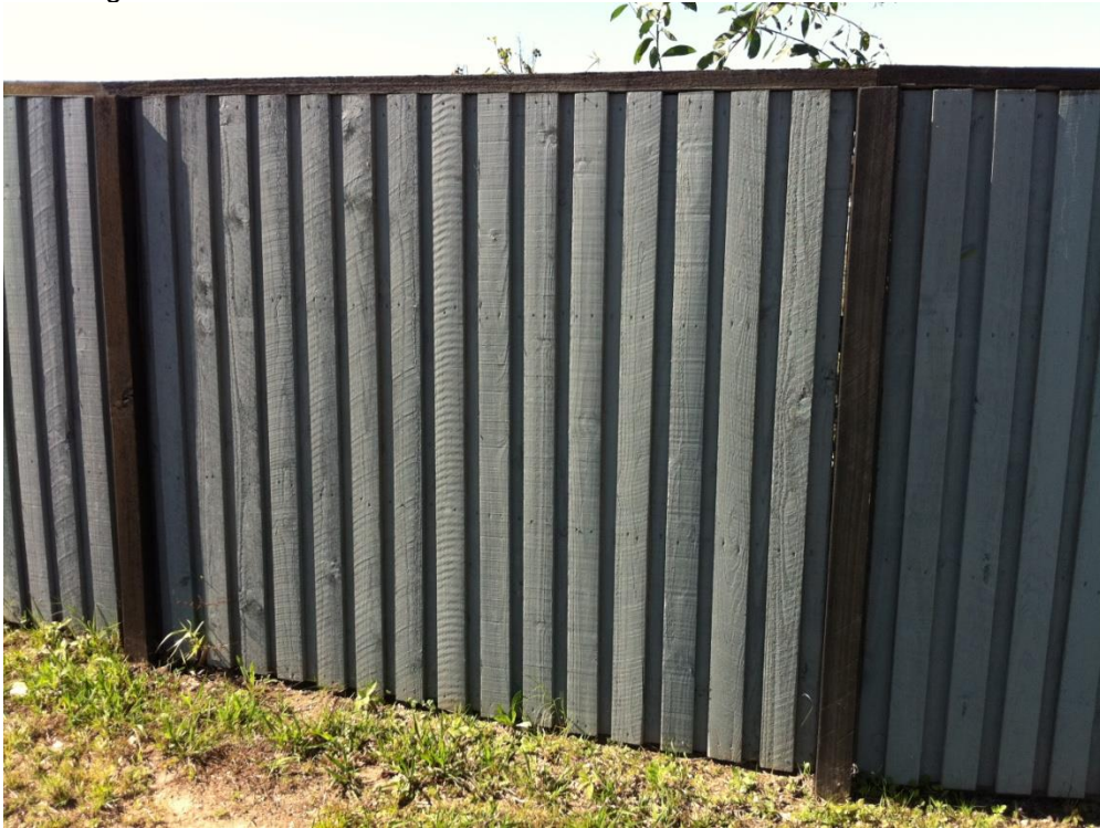
Photograph showing side fencing required