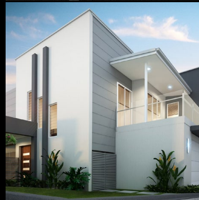
263 Ashmore Road