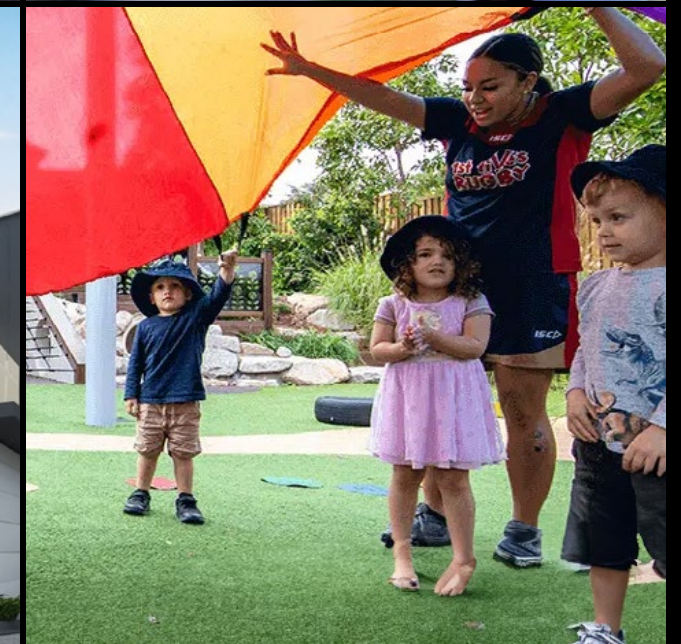
Shapes Early Learning, Redbank Plains