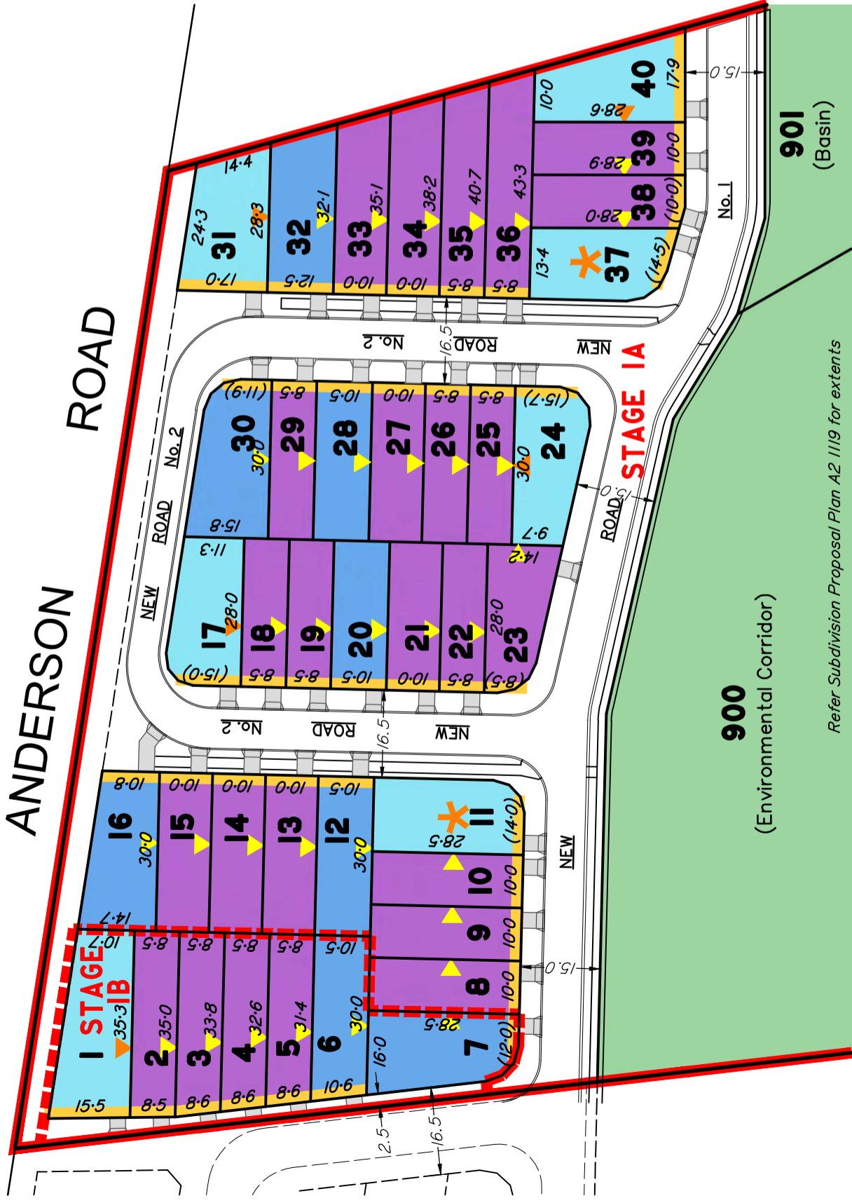
STAGE 1 Scale 1:1000