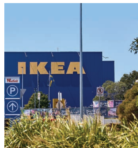
Just 20 minutes to major retail hubs