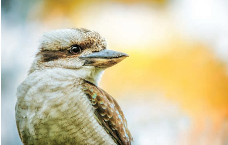
Embrace Sage's natural surroundings