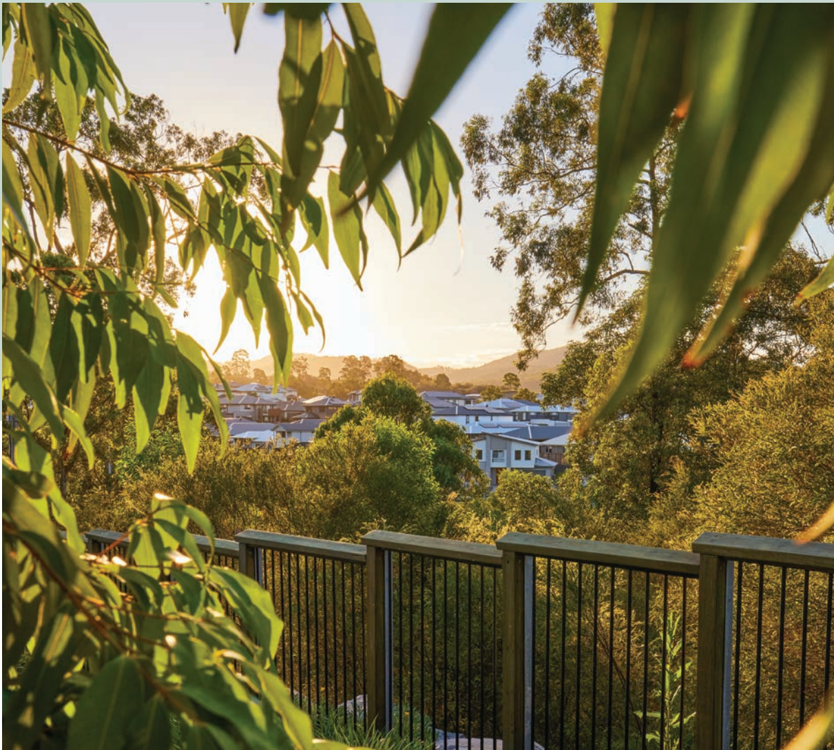
Cedar Woods Properties: Ellendale, Qld