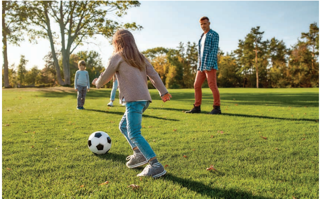
A place to grow and live naturally