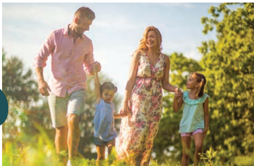
Spend quality family time enjoying the community park