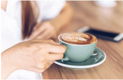
Enjoy coffee at local hotspots