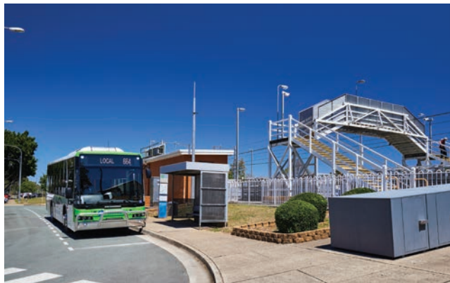
Easy access to public transport