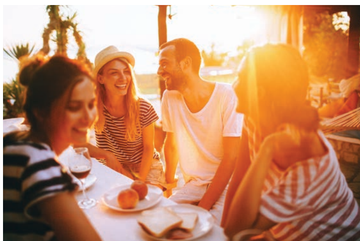
Catch up with friends at one of the many restaurants on your doorstep