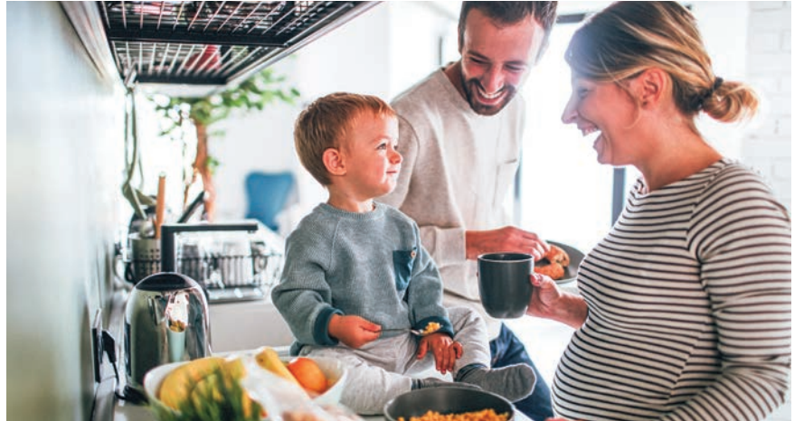
Enjoy slow mornings in your family home