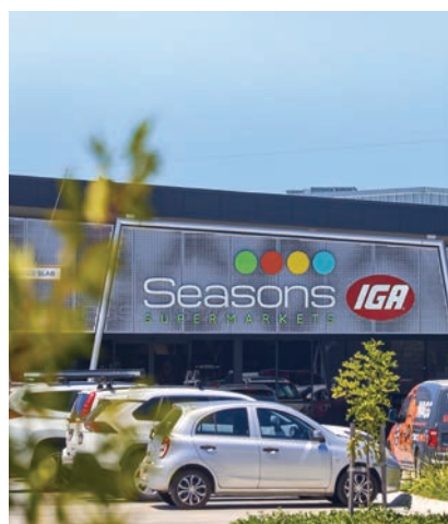
Local shops and amenity just moments away