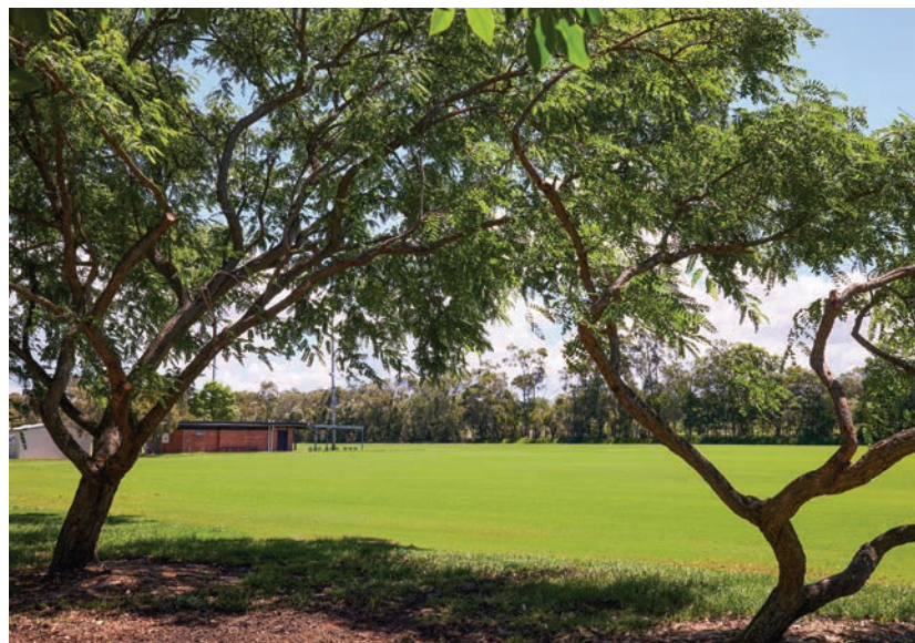
Take a bike ride to one of the many parks nearby