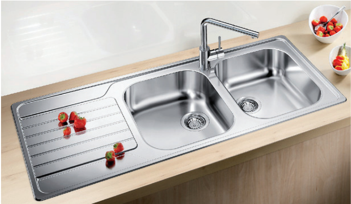
Stainless steel kitchen sink