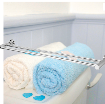
Double Towel Rail