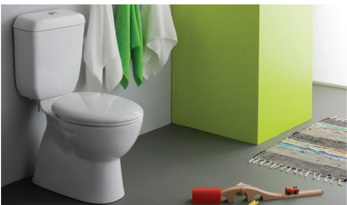
Vitreous china toilet suit