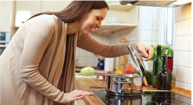
Electric ceramic cooktop