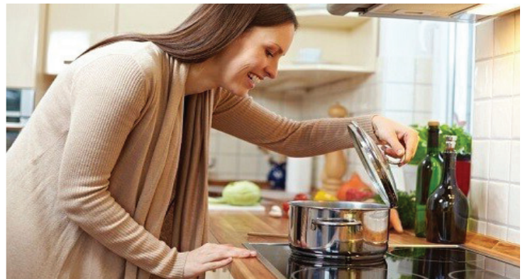
Electric ceramic cooktop