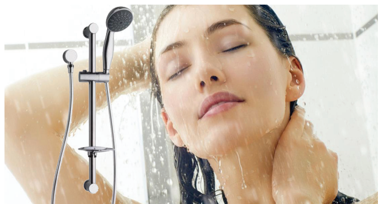
Rail Shower Mixer