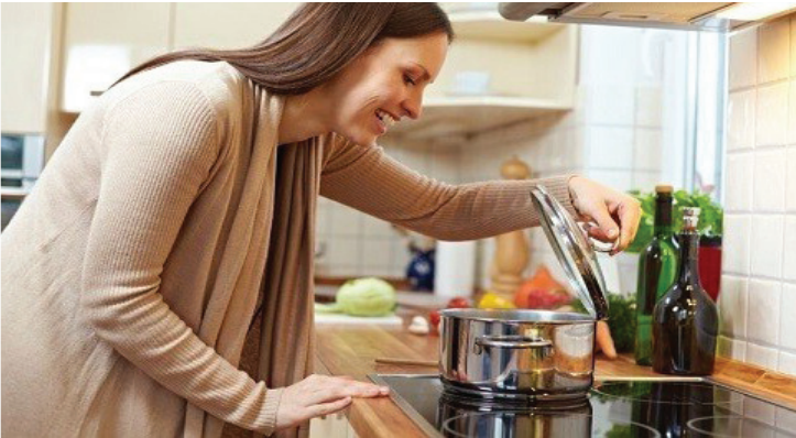
Electric ceramic cooktop