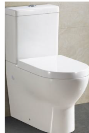
Back to wall toilet suite

Disclaimer: The Bathla Group reserves the right to amend prices and specifications without prior notice or obligation. The inclusions are current at time of printing but subject to change depending on availability.