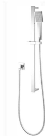
Adjustable Height Shower head