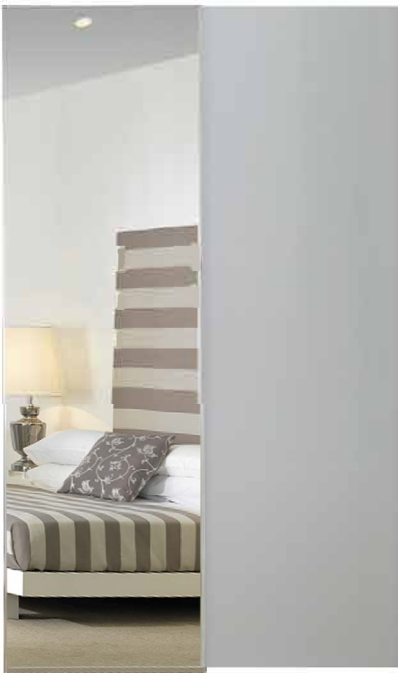
Frameless Sliding Wardrobe doors