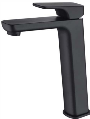
Matt Black Basin Mixer