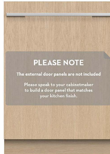
Fisher & Paykel DW60U2I1