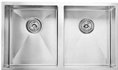
Double bowl Square Sink