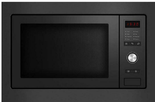
Fisher & Paykel OM25BLSB1