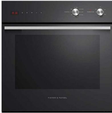
Fisher & Paykel OB60SC7LEB1