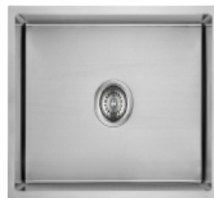
Drop in Laundry sink

Disclaimer: The Bathla Group reserves the right to amend prices and specifications without prior notice or obligation. The inclusions are current at time of printing but subject to change depending on availability.