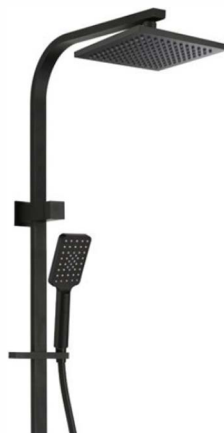
Adjustable Height Shower head