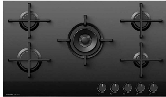
Fisher & Paykel CG905DNGGB4