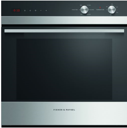
FISHER & PAYKEL OB60SC5CEX2