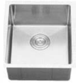
Drop in Laundry sink