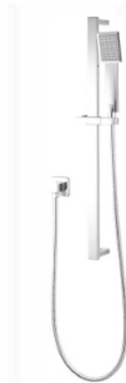
Adjustable Height Shower head