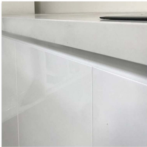
40mm Engineered Stone Benchtop