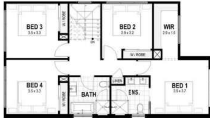
FIRST FLOOR 1:100