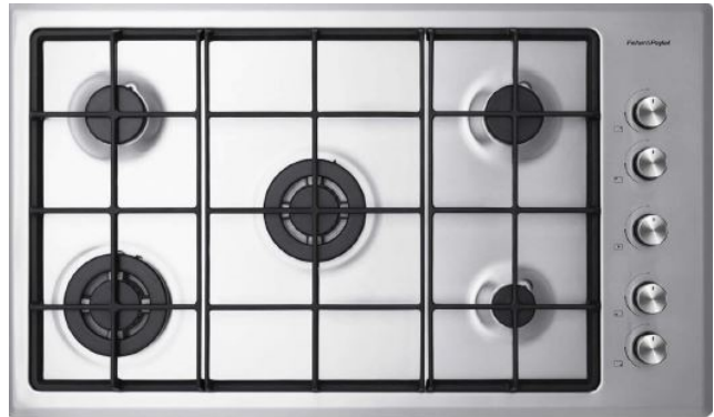
FISHER & PAYKEL CG905CNGX2