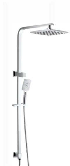
Multi Functional Shower head