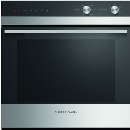
FISHER & PAYKEL OB60SC5CEX2