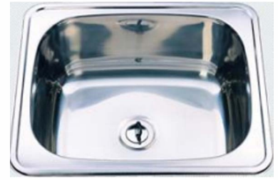
Drop in Laundry sink