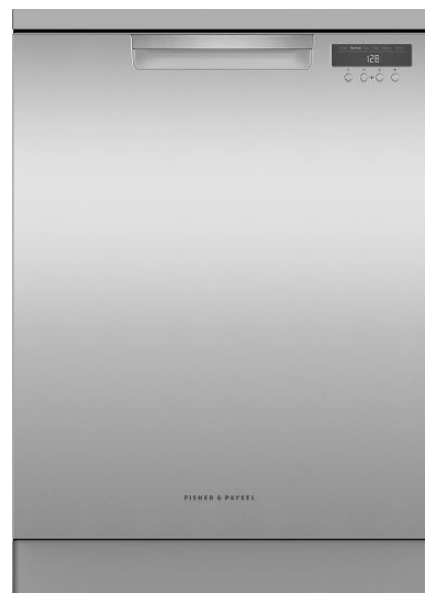
FISHER & PAYKEL DW60FC1X1

Disclaimer: The Bathla Group reserves the right to amend prices and specifications without prior notice or obligation. The inclusions are current at time of printing but subject to change depending on availability.