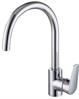
Gooseneck Mixer for Kitchen sink