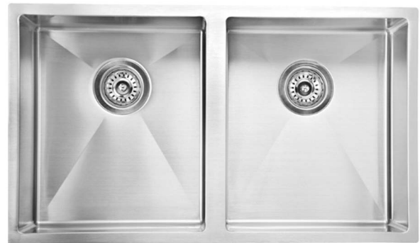
Double bowl Square Sink