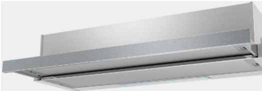
FISHER & PAYKEL HS90X4