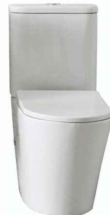
Back to wall toilet suite

Disclaimer: The Bathla Group reserves the right to amend prices and specifications without prior notice or obligation. The inclusions are current at time of printing but subject to change depending on availability.