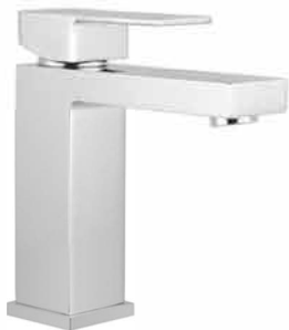
Bathroom Sink Mixer