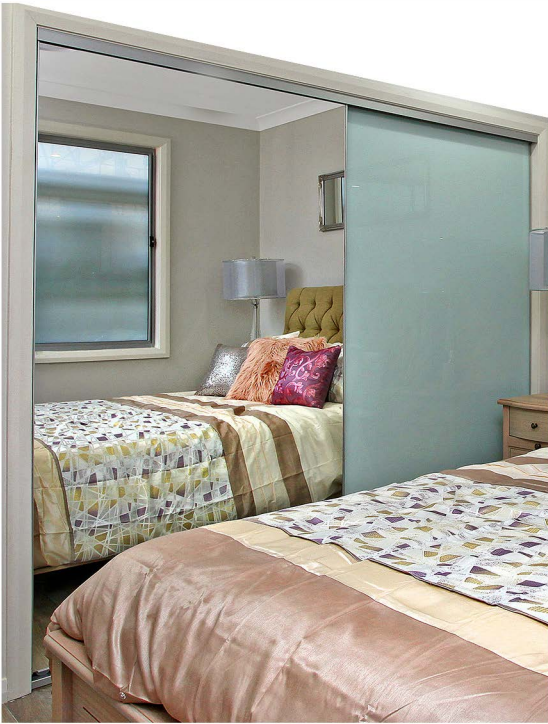
Semi Framed Sliding Wardrobe doors