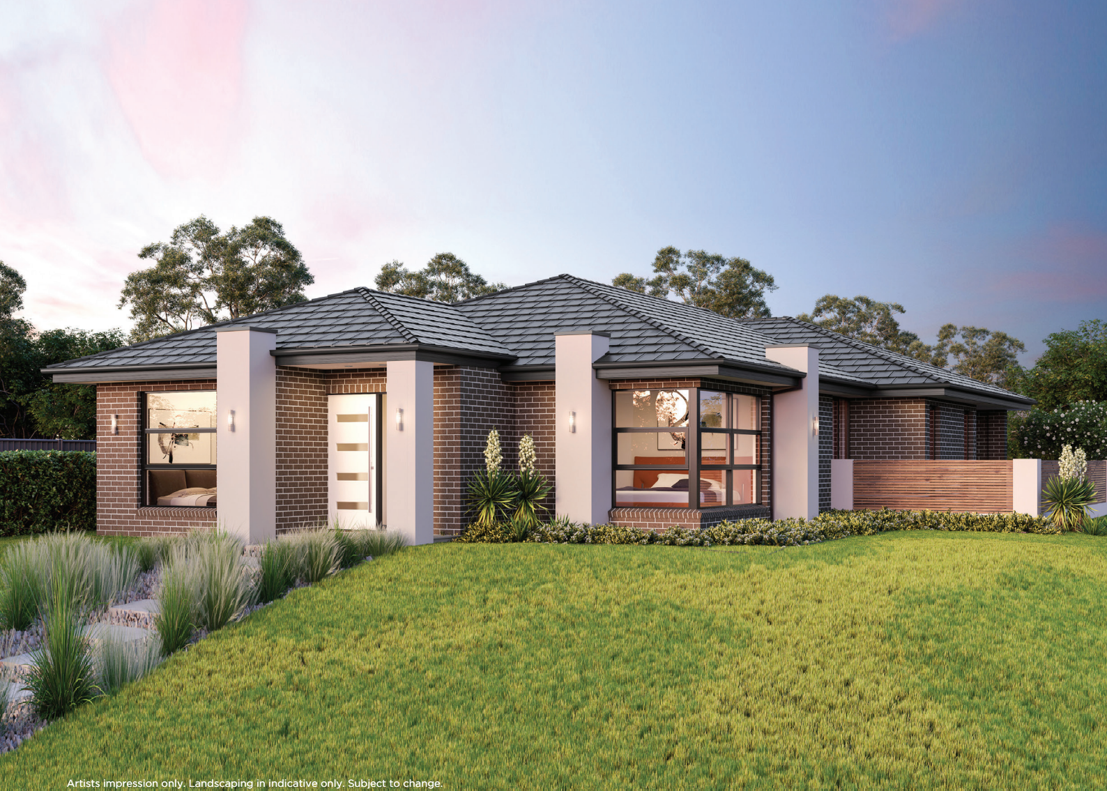
Artists impression only. Landscaping in indicative only. Subject to change.