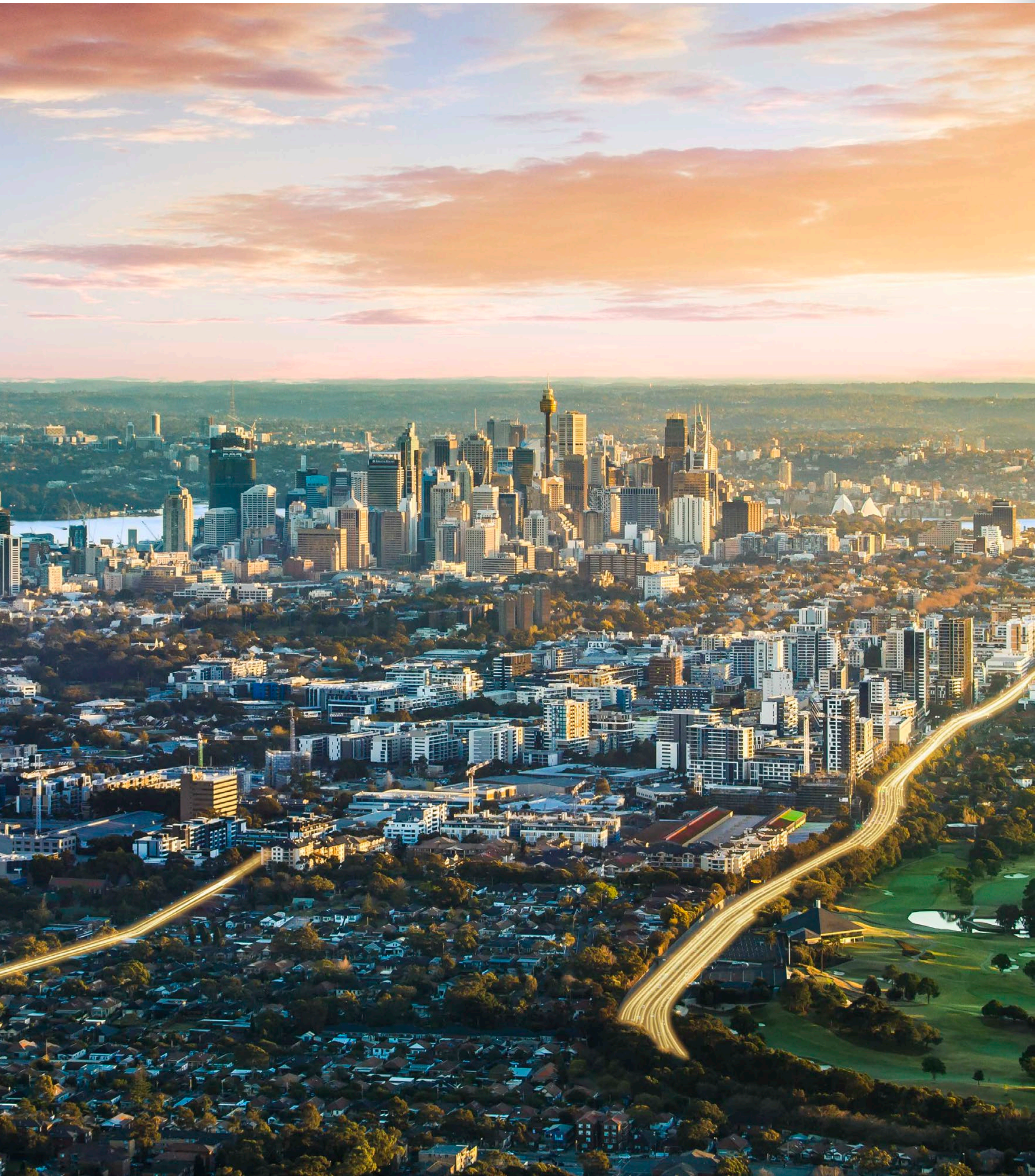
WATERFALL BY CROWN GROUP IS PERFECTLY SITUATED JUST 4KM FROM SYDNEY CBD. BOTTOM IMAGE: ALI YAH