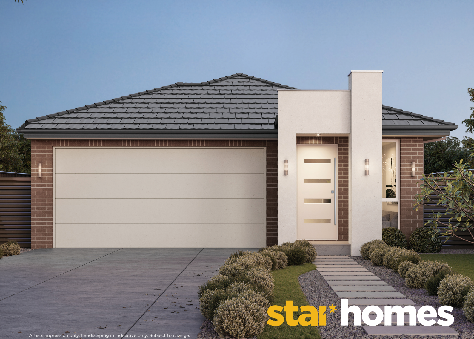
Artists impression only. Landscaping in indicative only. Subject to change.