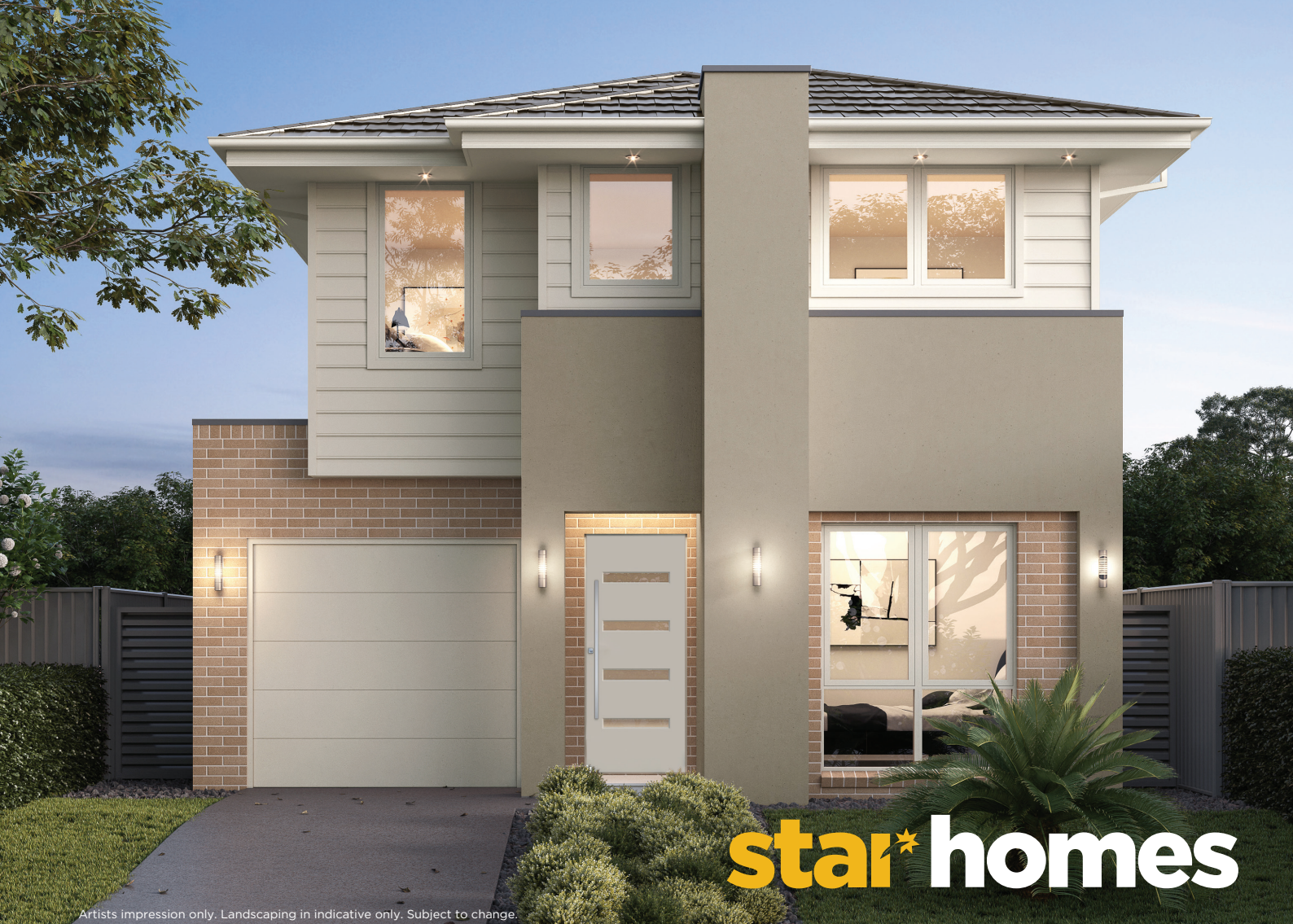
Artists impression only. Landscaping in indicative only. Subject to change.