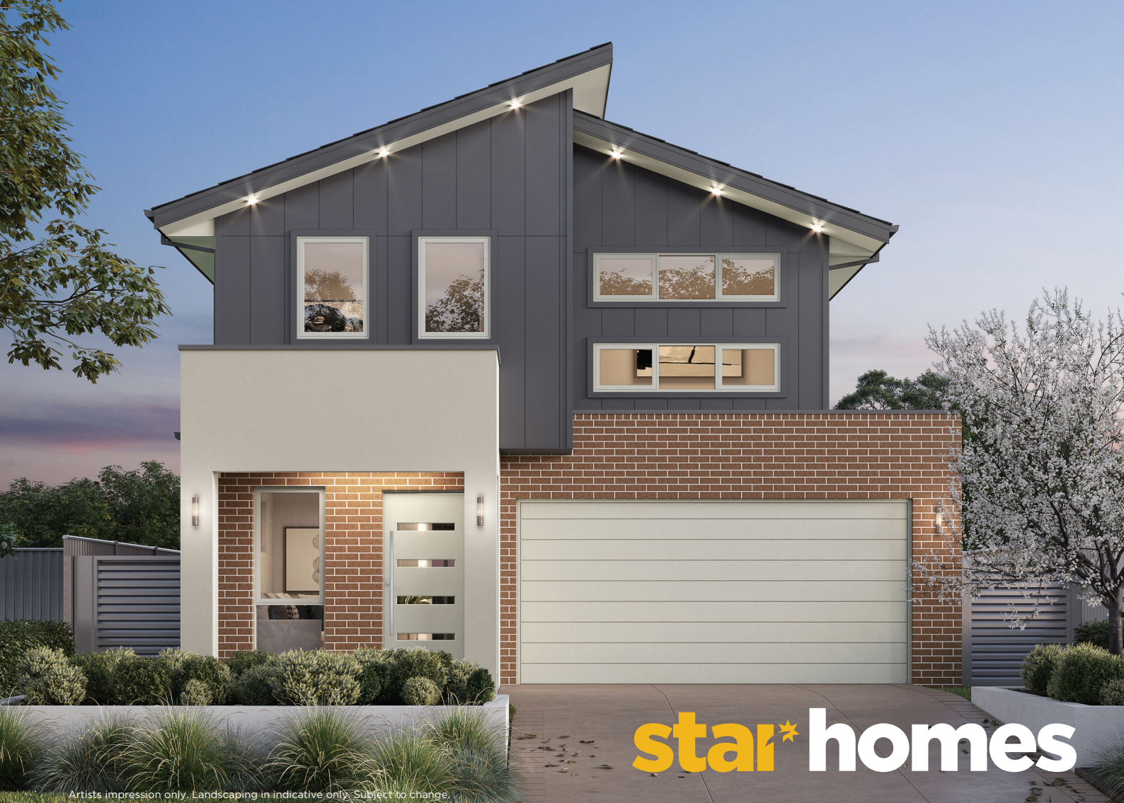
Artists impression only. Landscaping in indicative only. Subject to change.