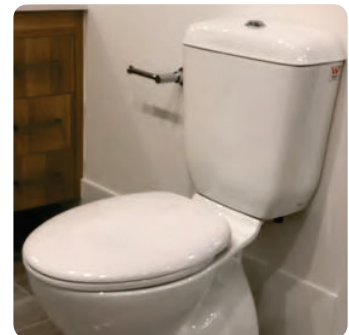
VITREOUS CHINA TOILET SUITE