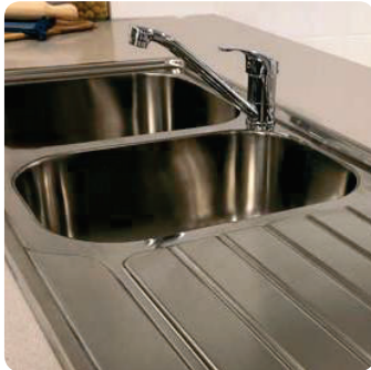
STAINLESS STEEL KITCHEN SINK

When designing our properties, we consider functionality and style, choosing products that are sleek, practical and tactile.