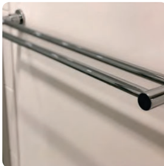
DOUBLE TOWEL RAIL