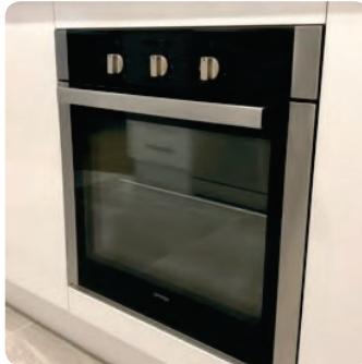
UNDER BENCH OVEN