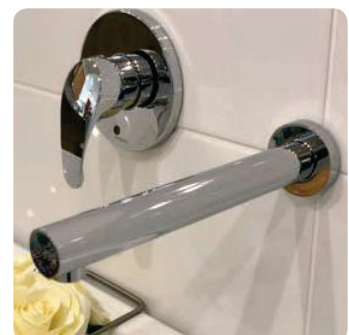
CHROME BATH TAPWARE