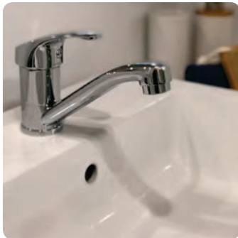
ACRYLIC BATHROOM BASIN & MIXER