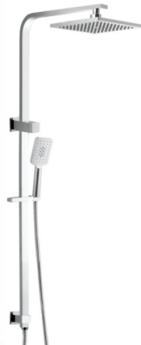
Multi Functional Shower head