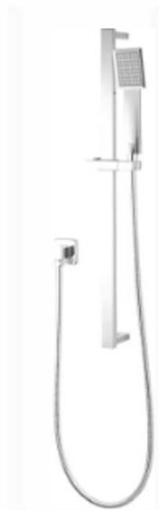
Adjustable Height Shower head