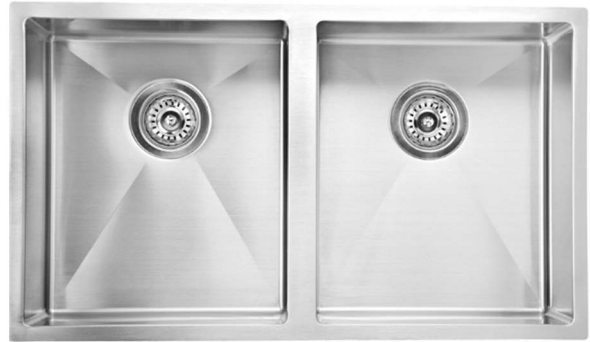
Double bowl Square Sink