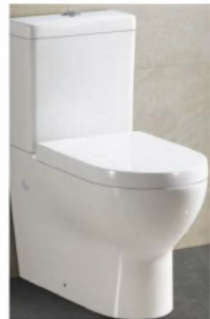
Back to wall toilet suite

Disclaimer: The Bathla Group reserves the right to amend prices and specifications without prior notice or obligation. The inclusions are current at time of printing but subject to change depending on availability.