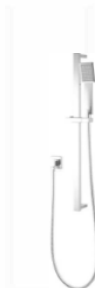
Adjustable Height Shower head