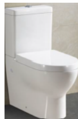
Back to wall toilet suite

Disclaimer: The Bathla Group reserves the right to amend prices and specifications without prior notice or obligation. The inclusions are current at time of printing but subject to change depending on availability.