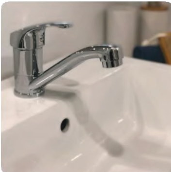
ACRYLIC BATHROOM BASIN & MIXER