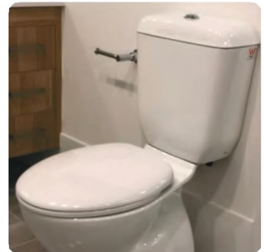
VITREOUS CHINA TOI