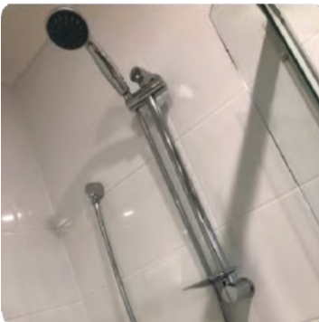
RAIL SHOWER MIXER