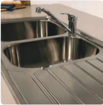
STAINLESS STEEL KITCHEN SINK