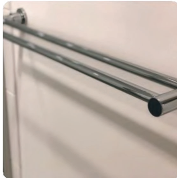
DOUBLE TOWEL RAIL