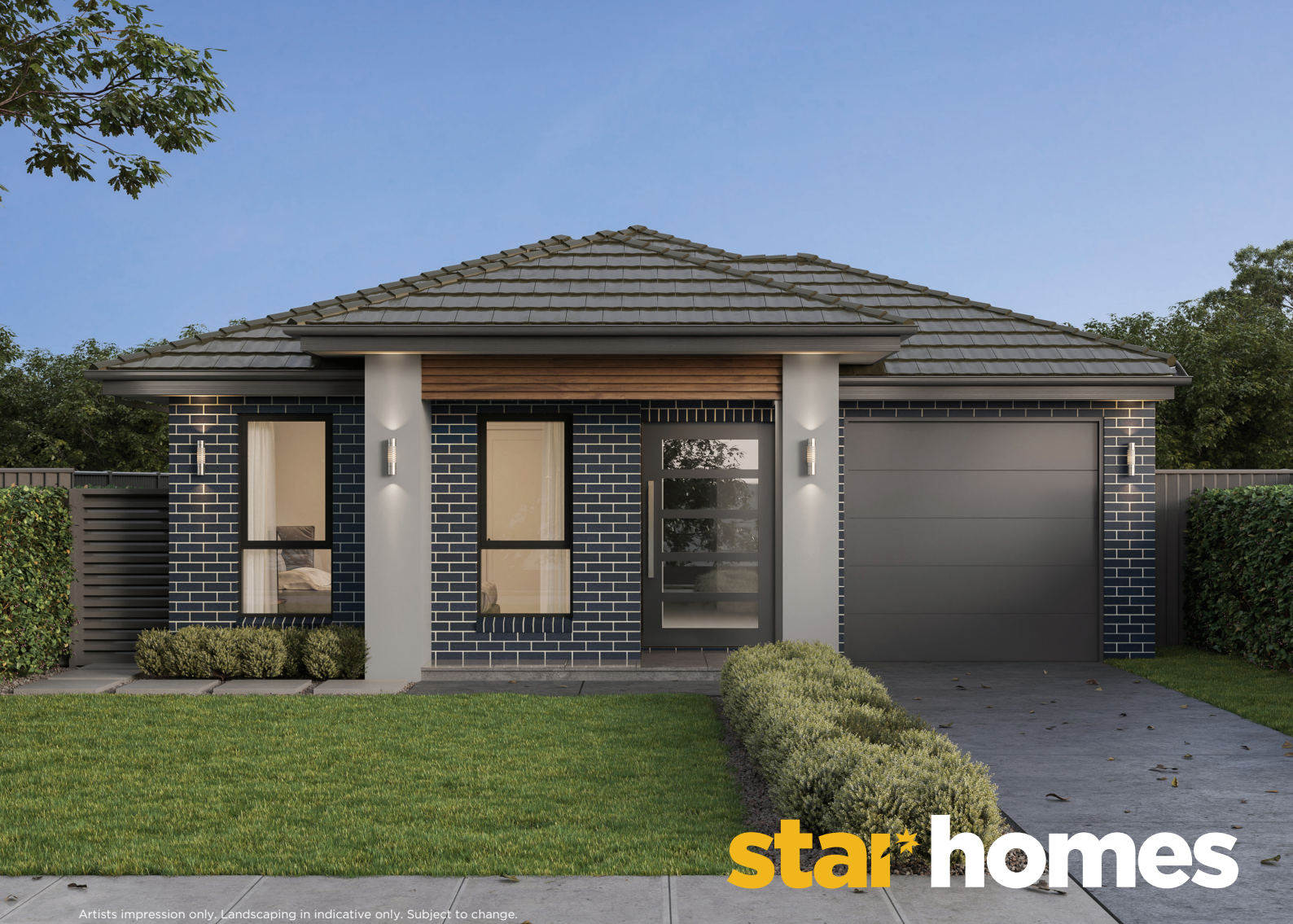
Artists impression only. Landscaping in indicative only. Subject to change.