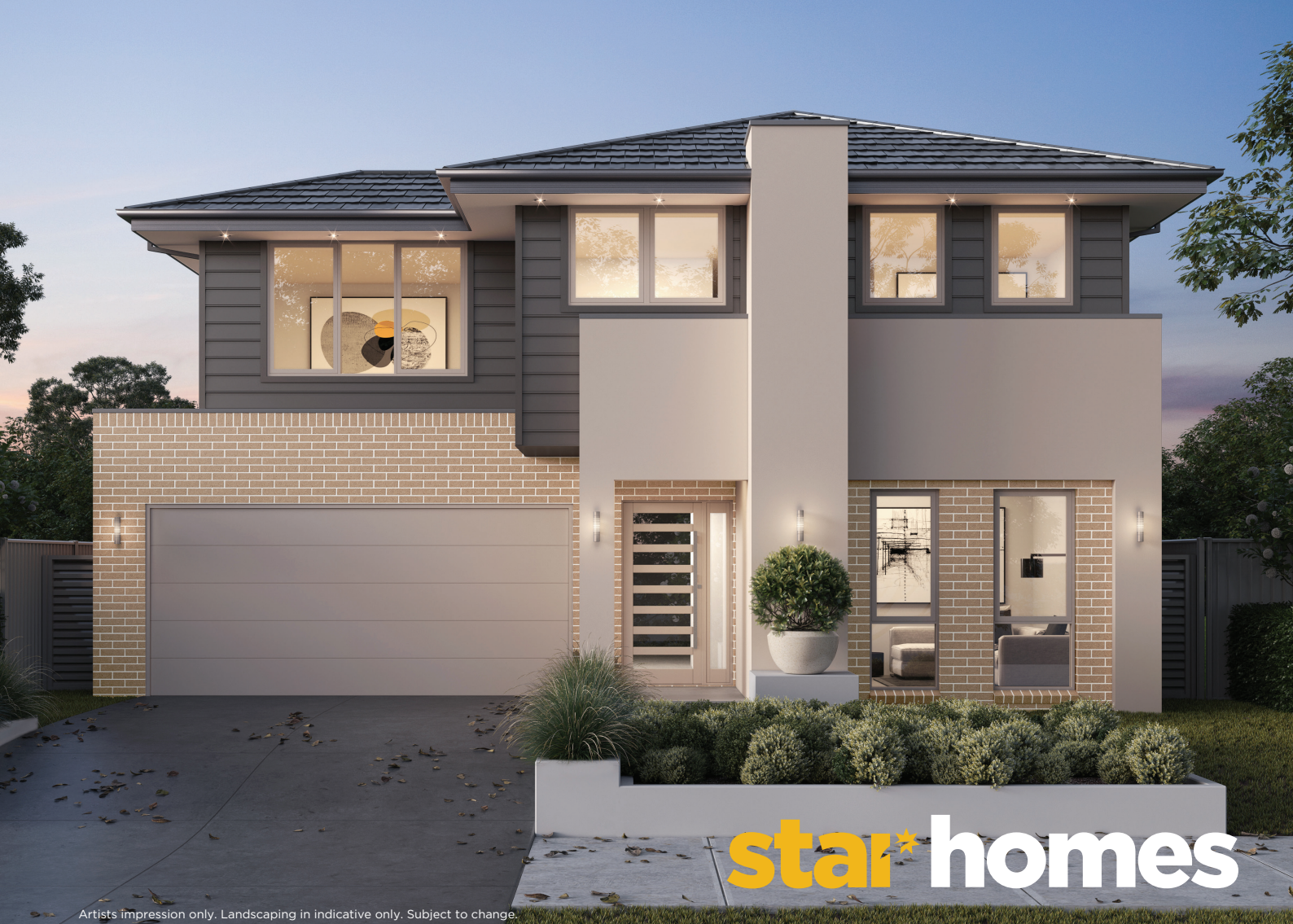
Artists impression only. Landscaping in indicative only. Subject to change.