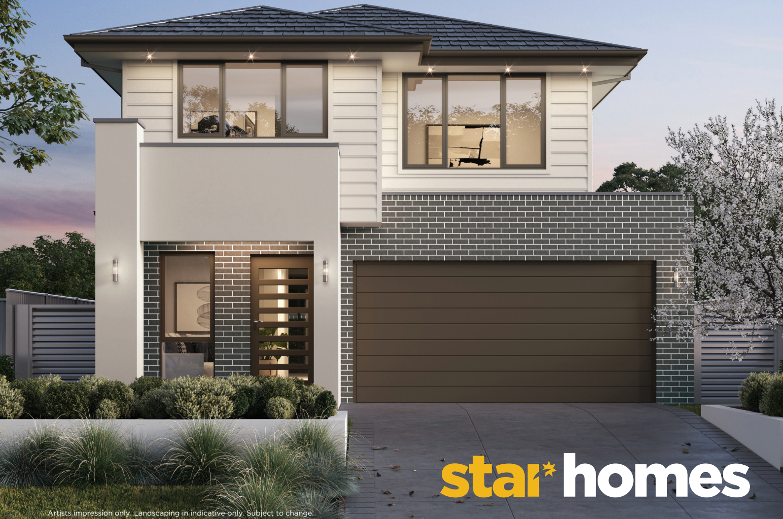
Artists impression only. Landscaping in indicative only. Subject to change.