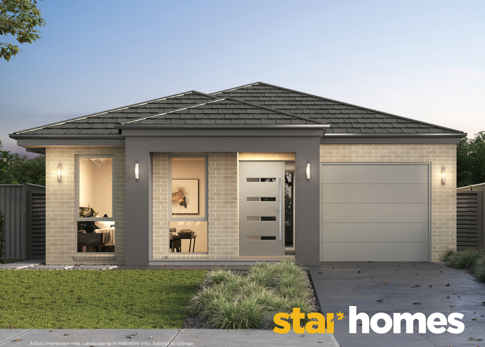
Artists impression only. Landscaping in indicative only. Subject to change.