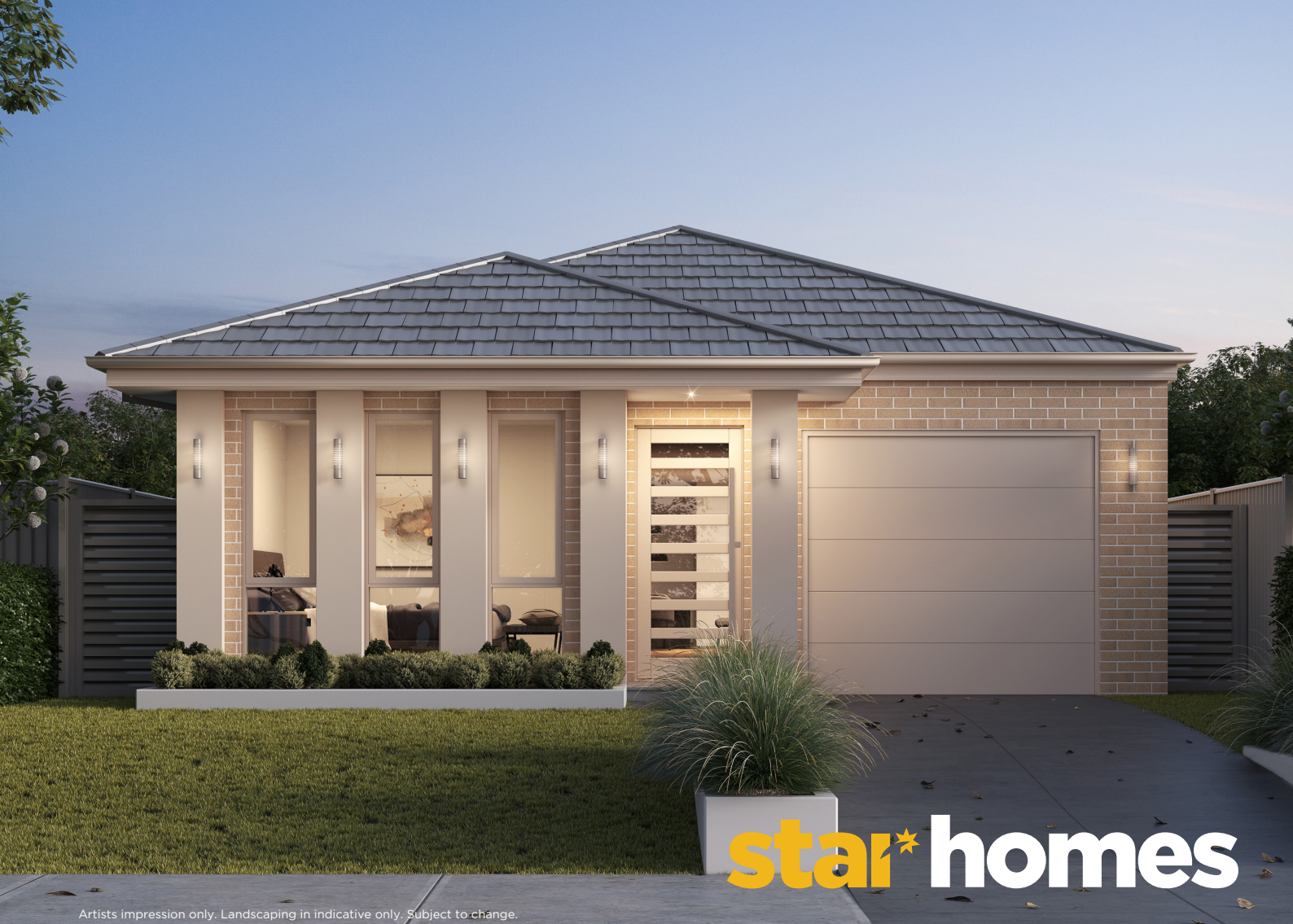
Artists impression only. Landscaping in indicative only. Subject to change.