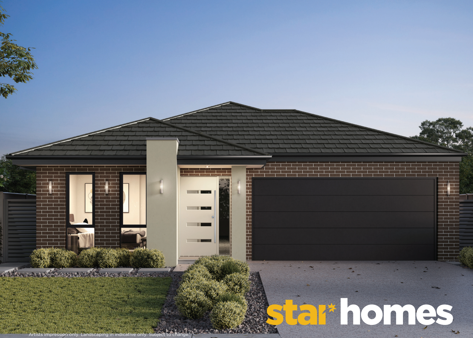
Artists impression only. Landscaping in indicative only. Subject to change.