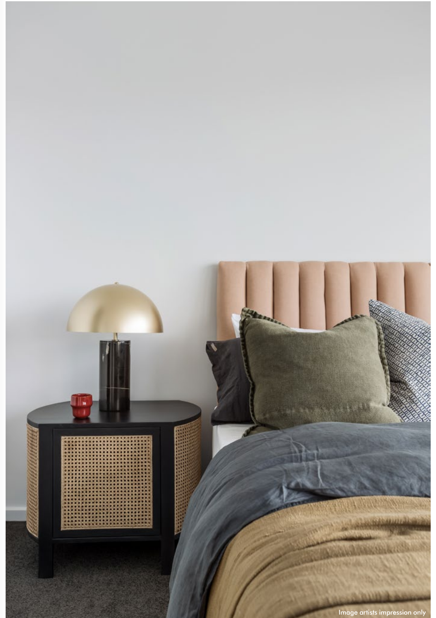
Image artists impression only