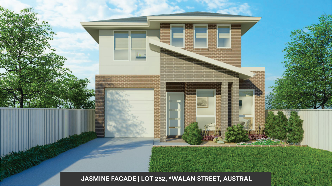
JASMINE FACADE | LOT 252, *WALAN STREET, AUSTRAL