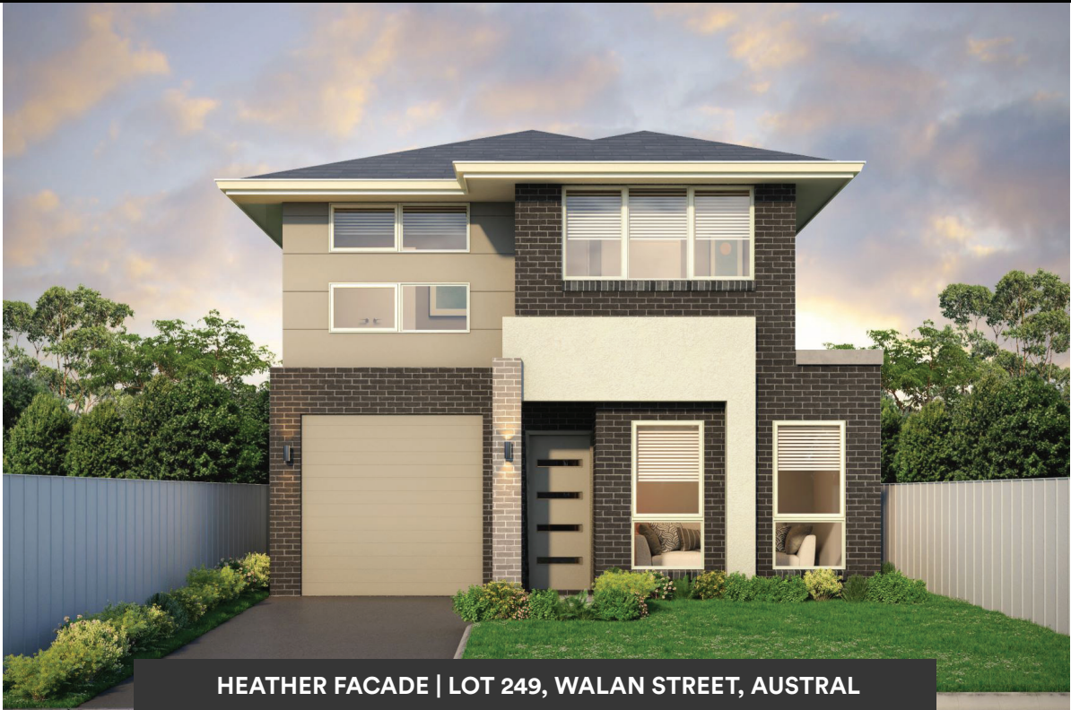
HEATHER FACADE | LOT 249, WALAN STREET, AUSTRAL