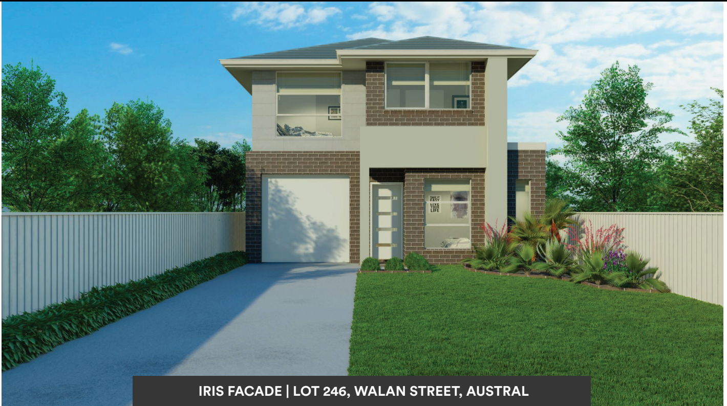
IRIS FACADE | LOT 246, WALAN STREET, AUSTRAL