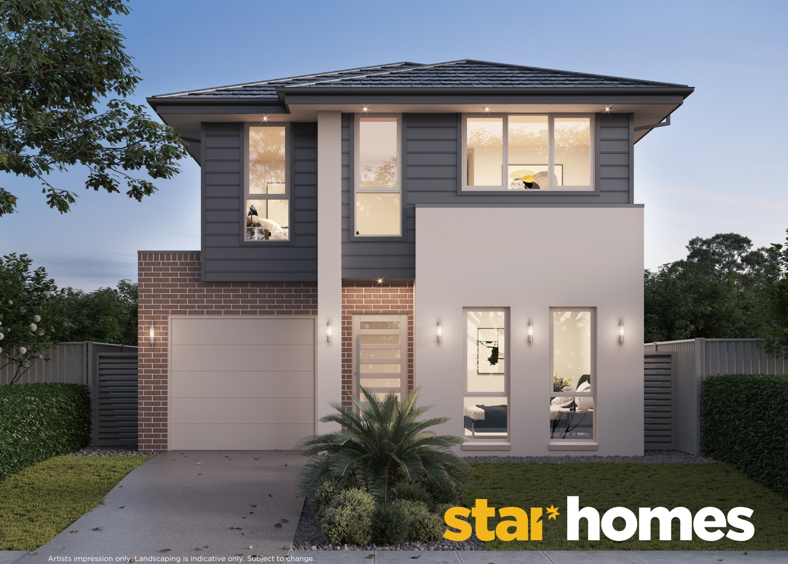
Artists impression only. Landscaping is indicative only. Subject to change.