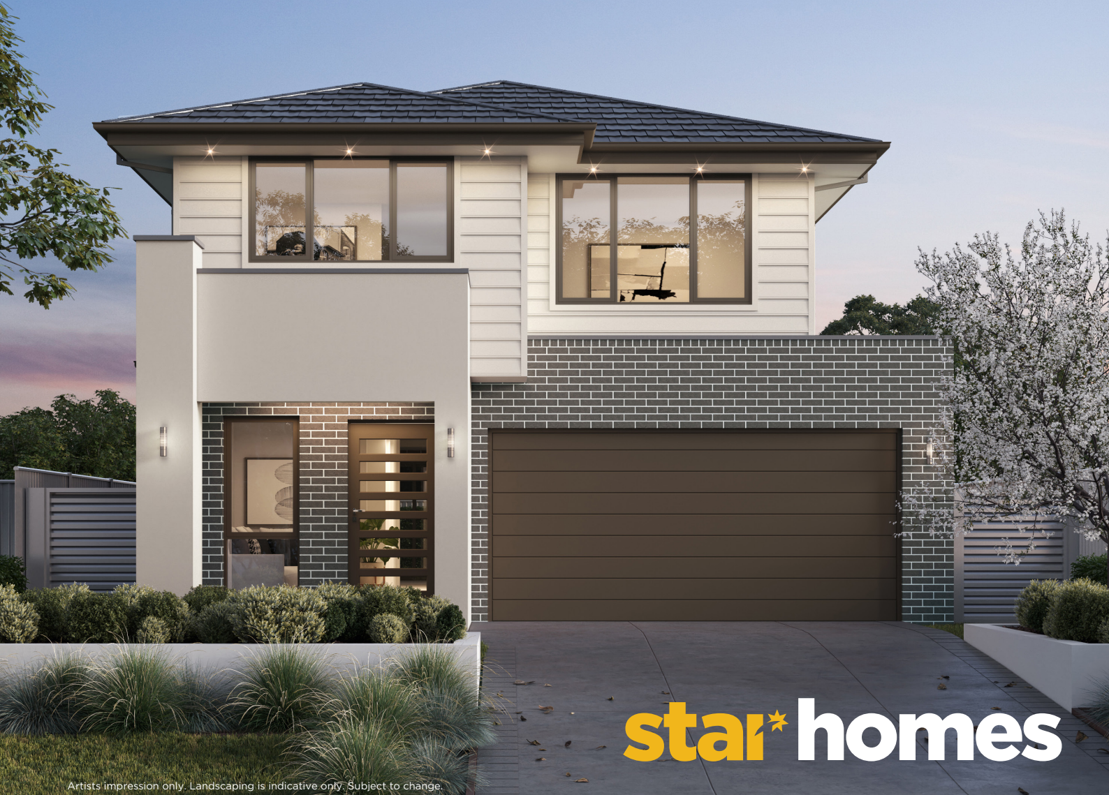
Artists impression only. Landscaping is indicative only. Subject to change.