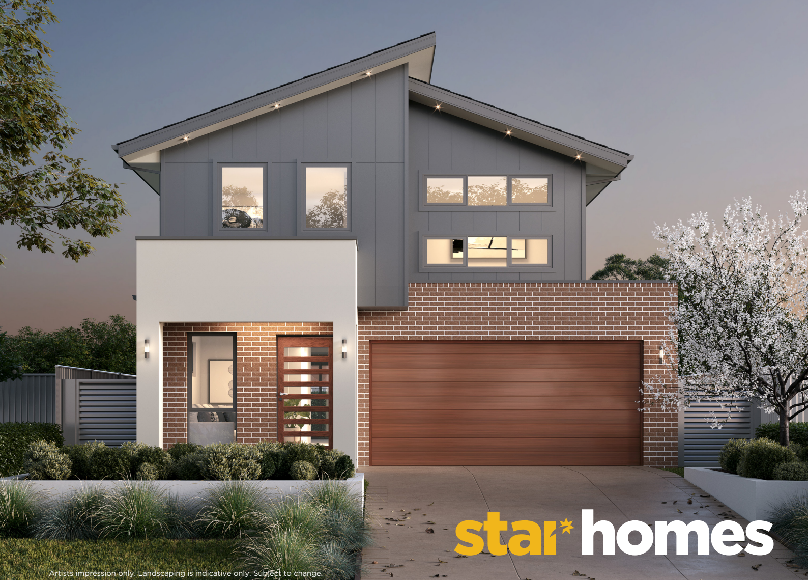
Artists impression only. Landscaping is indicative only. Subject to change.