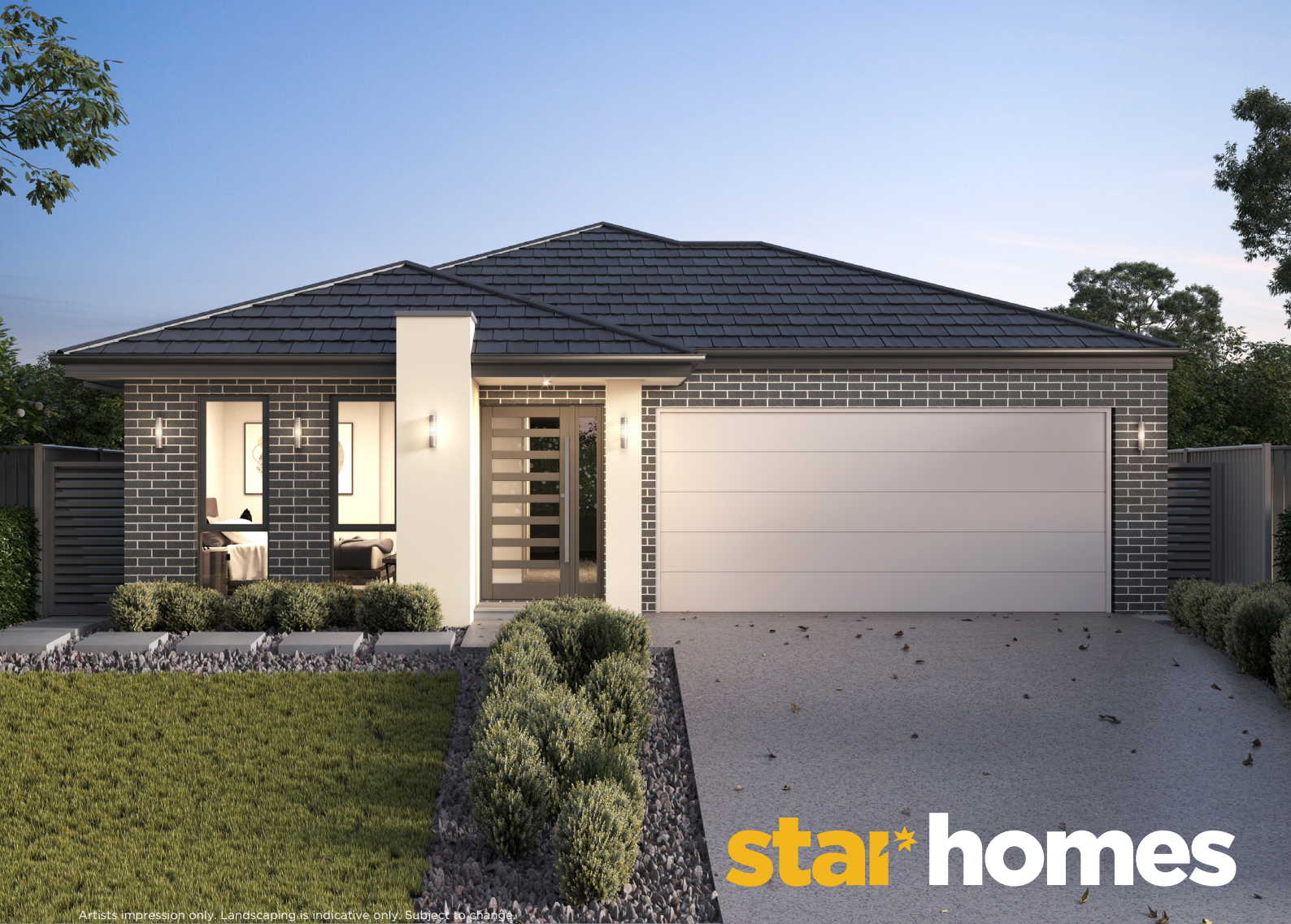
Artists impression only. Landscaping is indicative only. Subject to change.