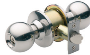
Gainsborough Governor Entrance Set