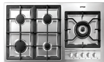
Omega OG92XA 900mm wide Gas Cooktop