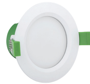
12 x Clipsal 9Watt LED Downlights