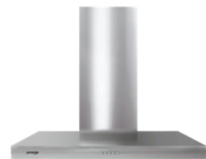
Omega ORC93X 900mm wide Canopy Rangehood