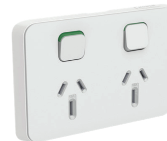
10 x Double Powerpoints