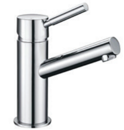
Mizu Drift Basin Mixer