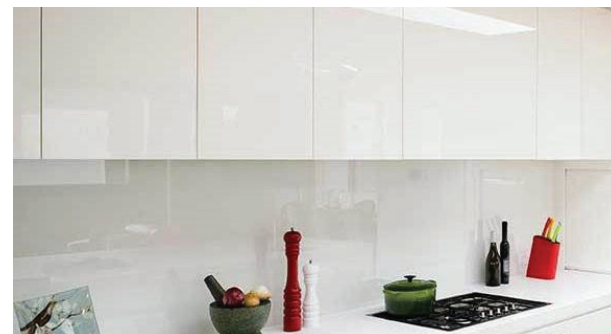
Polyurethane kitchen style 1 (note, finish only)