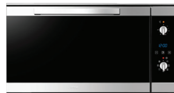
Omega 00971XN Oven