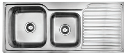
Posh Solus MKII Kitchen Sink