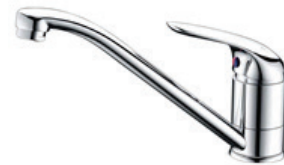
Posh Bristol MKII Sink Mixer