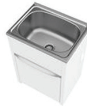
Clark Eureka Plus Laundry Tub