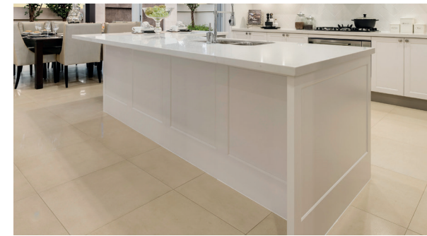
600x600 porcelain tiles