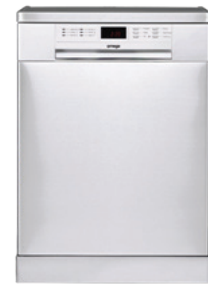
Omega ODW717XB Dishwasher