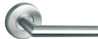
Internal lever door handles