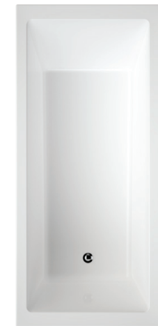
Caroma Newbury 1500/1700 Long Island Bath (As per design)