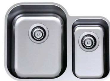
Clark Monaco 1.5 undermount sink