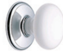
Gainsborough 300 Contractor Series Classic