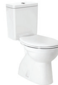
Porche Quatre Closed Couple Toilet Suite