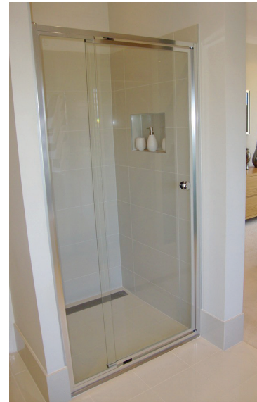
Semi-framed silver screens including stainless steel hob