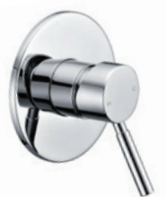
Mizu Drift Shower Mixer