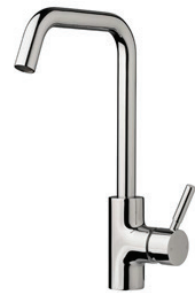
Mizu Drift Square Sink Mixer