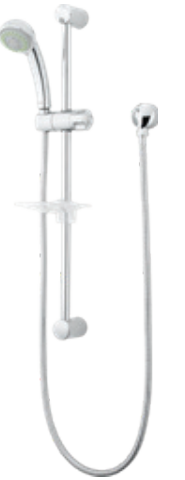
Bermuda 3 Function Shower Rail