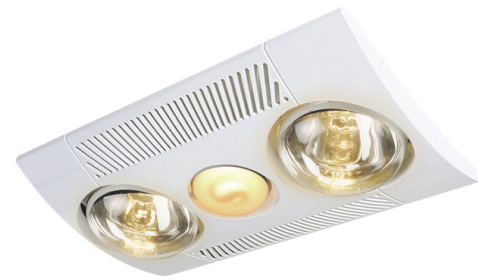
2 x Fan/Light/2 heat lamp including circuit