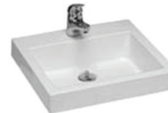
Manooga Cove Square Basin COV70