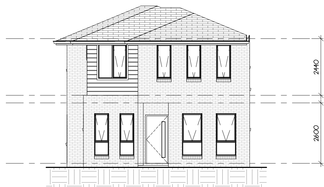
3 Front Elevation 1 : 100