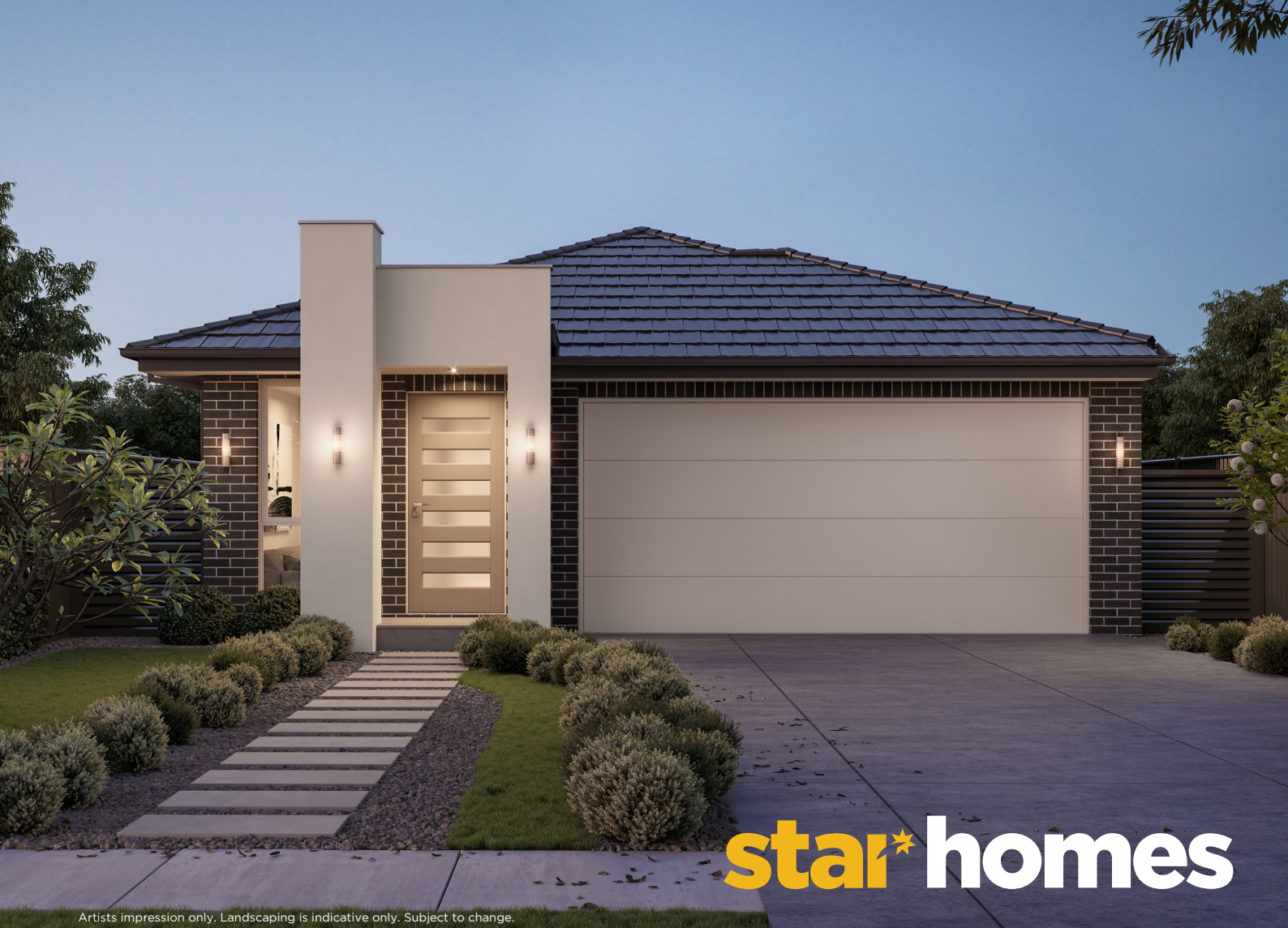
Artists impression only. Landscaping is indicative only. Subject to change.