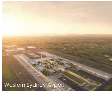
Western Sydney Airport