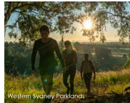
Western Sydney Parklands