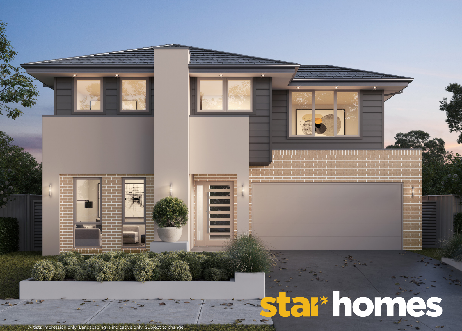
Artists impression only. Landscaping is indicative only. Subject to change.