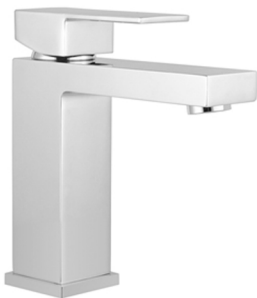
Bathroom Sink Mixer