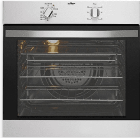
Westinghouse Oven WVE613WC/SC 600mm