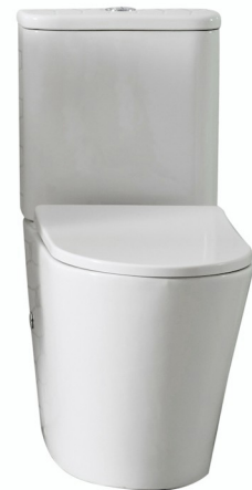
Back to wall toilet suite

Disclaimer: The Bathla Group reserves the right to amend prices and specifications without prior notice or obligation. The inclusions are current at time of printing but subject to change depending on availability.