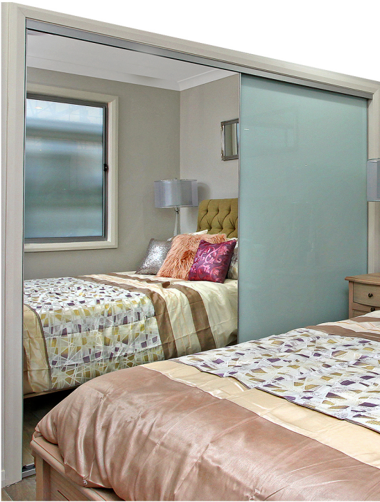
Semi Framed Sliding Wardrobe doors