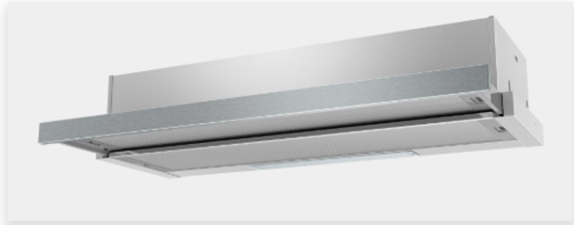
Westinghouse Rangehood WRR904SB