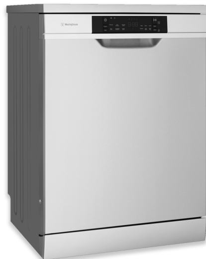
Westinghouse Dishwasher WSF6606XA

Disclaimer: The Bathla Group reserves the right to amend prices and specifications without prior notice or obligation. The inclusions are current at time of printing but subject to change depending on availability.