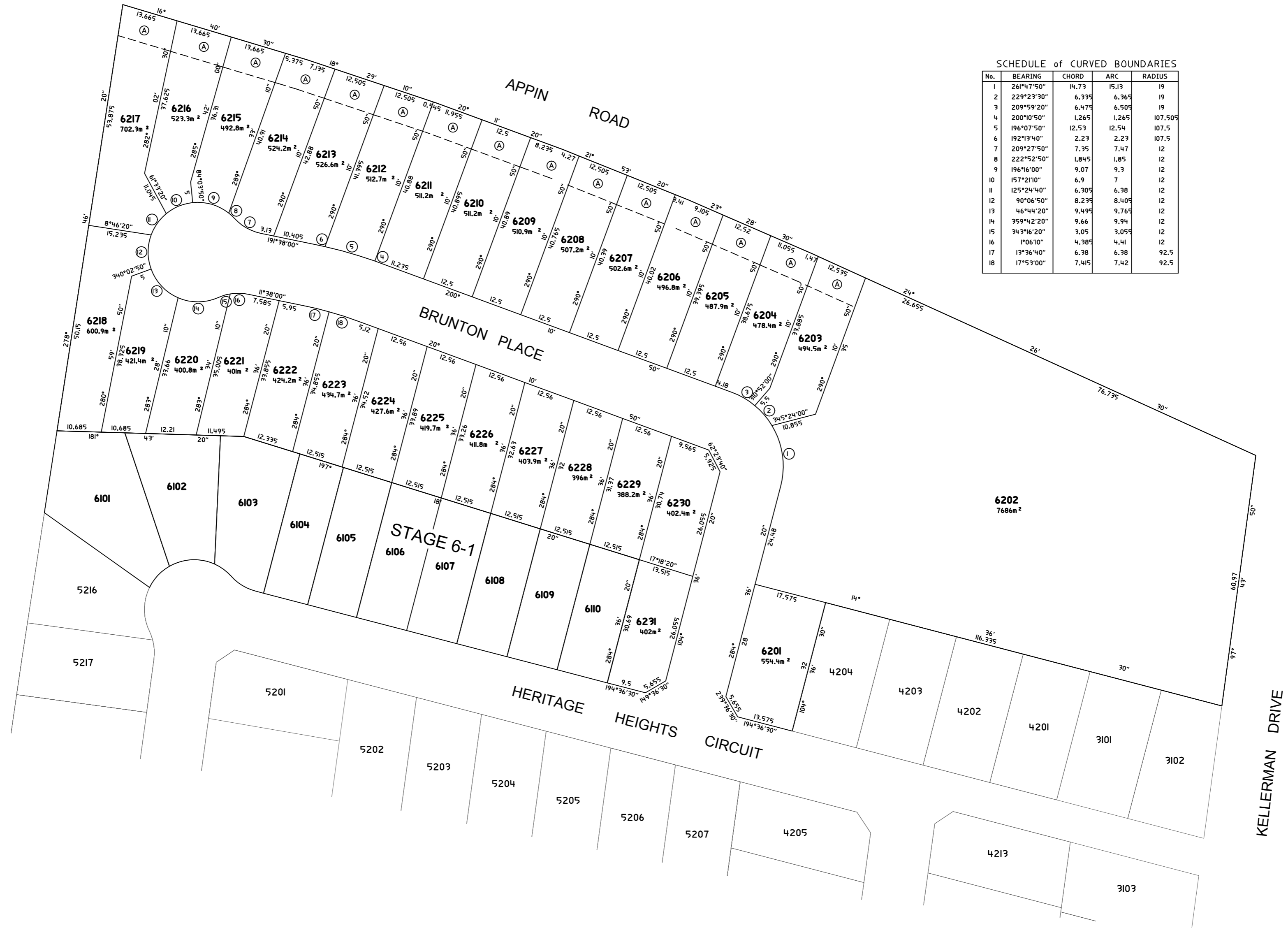
SCHEDULE of CURVED BOUNDARIES

(A) RESTRICTION ON THE USE OF LAND 15m WIDE