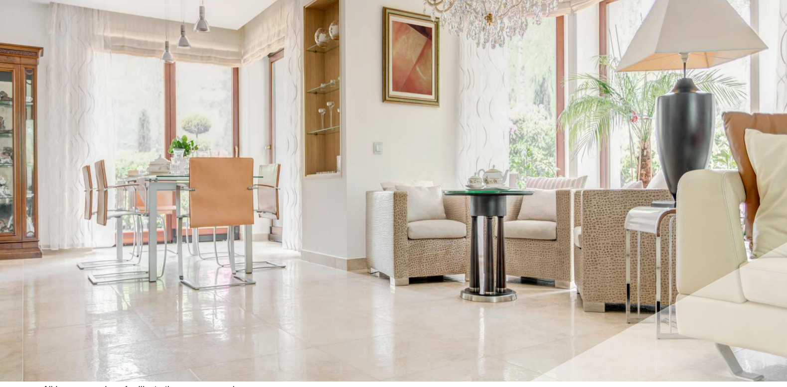
All images used are for illustration purposes only.