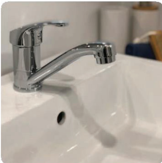
ACRYLIC BATHROOM BASIN & MIXER