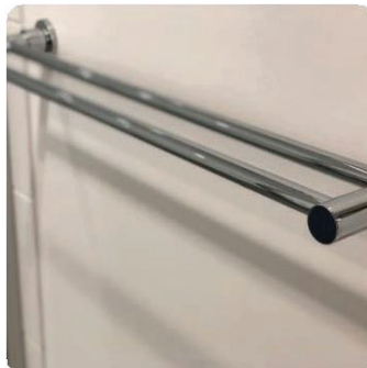
DOUBLE TOWEL RAIL