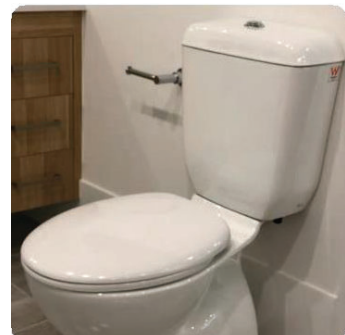
VITREOUS CHINA TOI