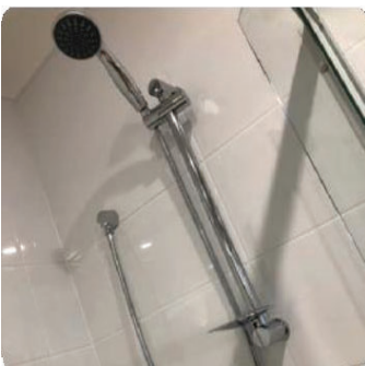
RAIL SHOWER MIXER