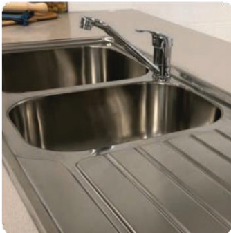
STAINLESS STEEL KITCHEN SINK