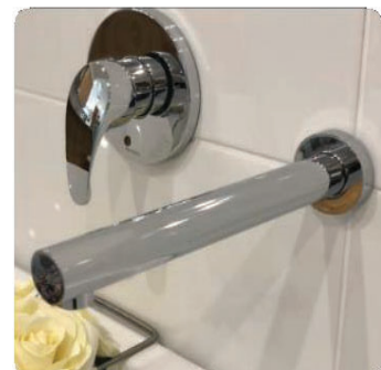
CHROME BATH TAPWARE