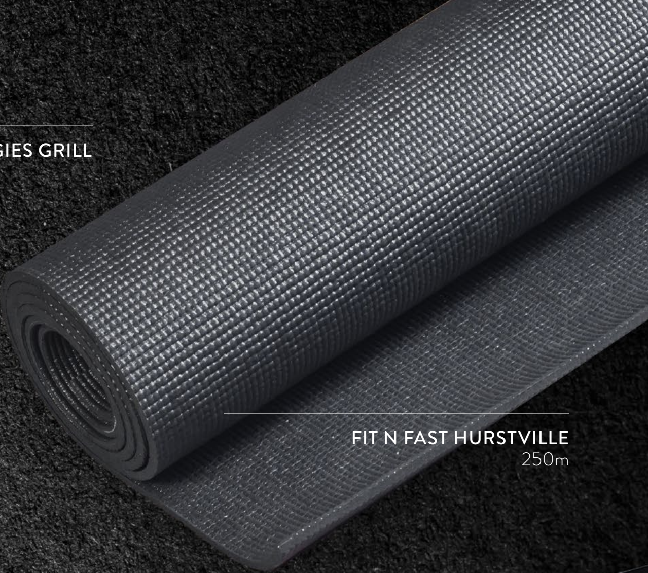
FIT N FAST HURSTVILLE 250m