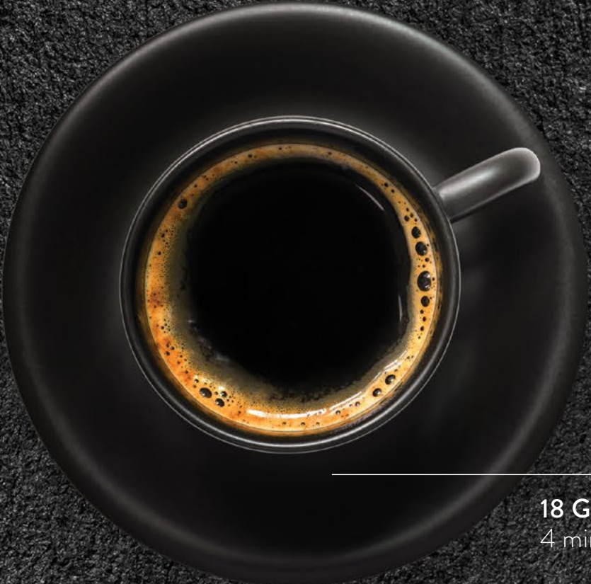
18 GRAMS ESPRESSO 4 minute walk