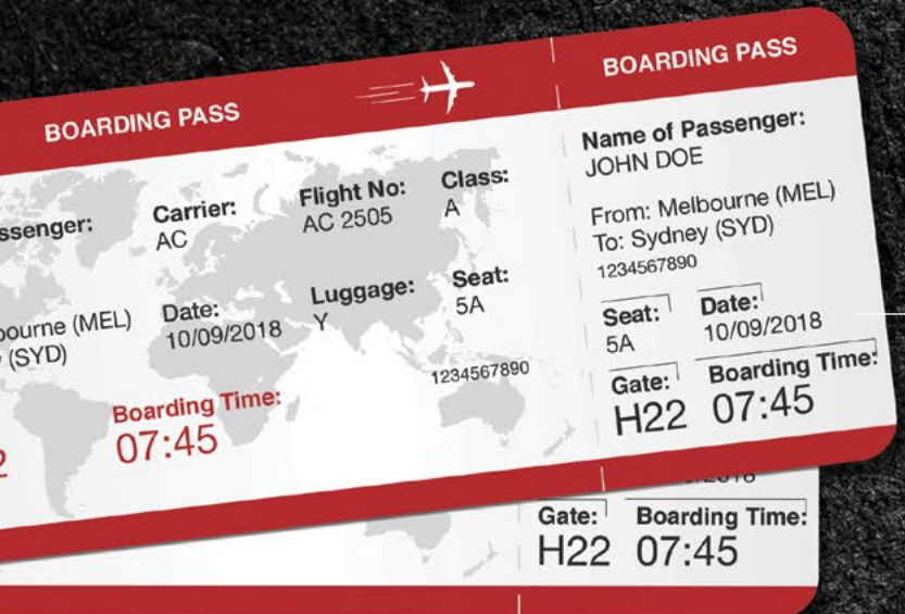
SYDNEY AIRPORT 20 minute drive