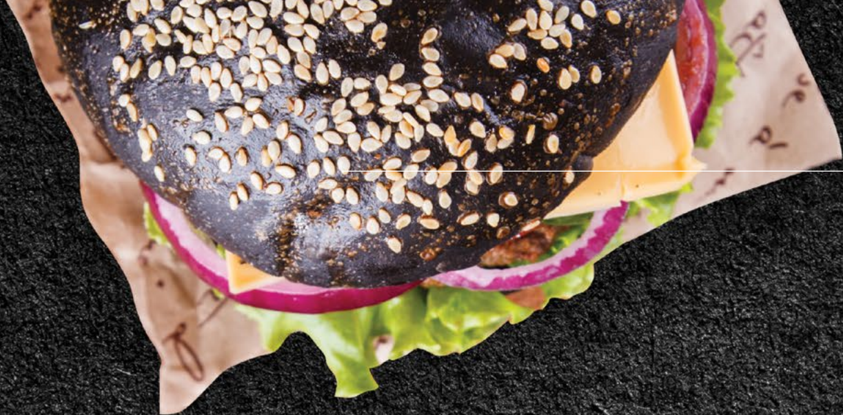
DOUGIES GRILL 150m