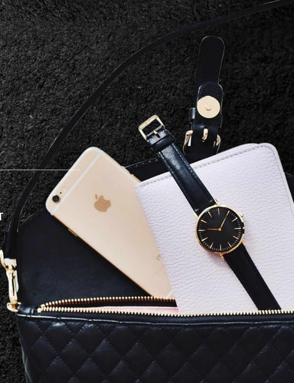
WESTFIELD HURSTVILLE 400m WESTFIELD SHOPPING PRECINCT 100m