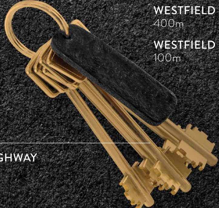
PRINCES HIGHWAY 7 minute drive