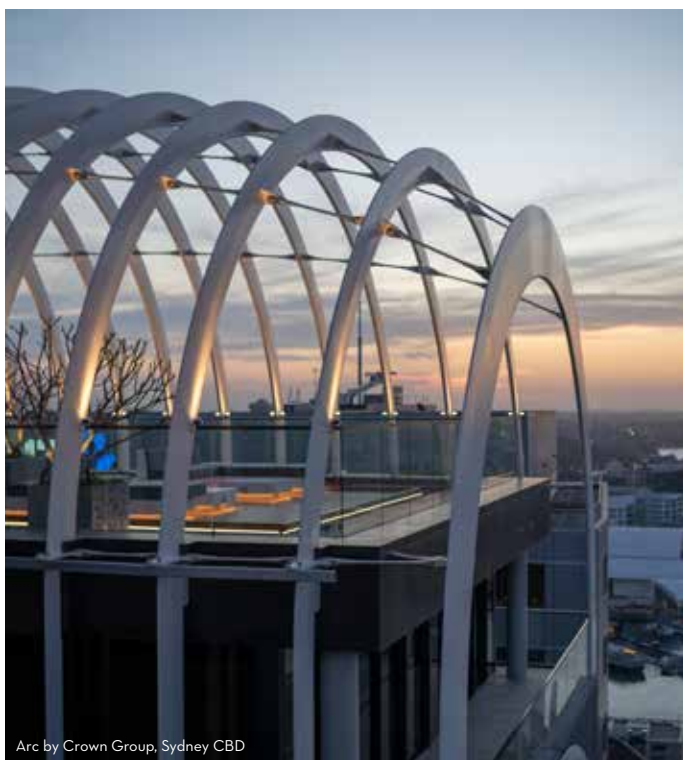
Arc by Crown Group, Sydney CBD