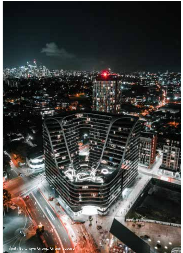
Infinity by Crown Group, Green Square