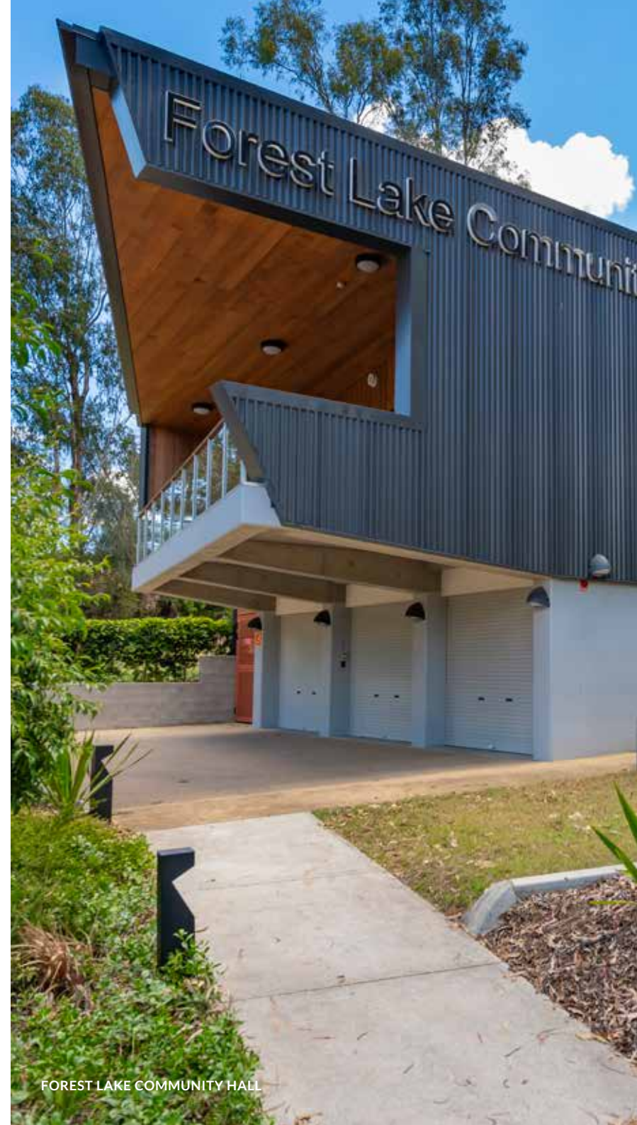
FOREST LAKE COMMUNITY HALL