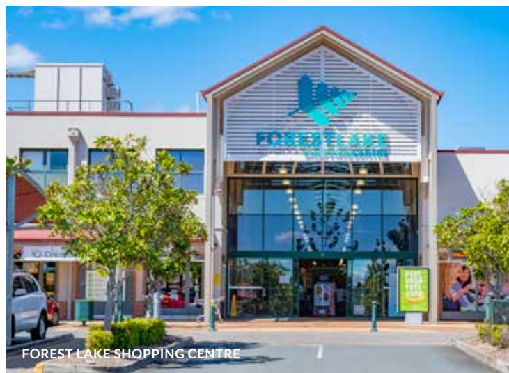
FOREST LAKE SHOPPING CENTRE