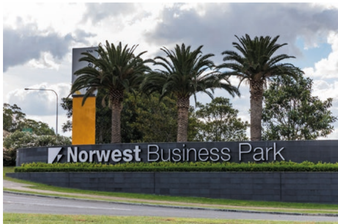
Tallawong enjoys close proximity to Norwest business park