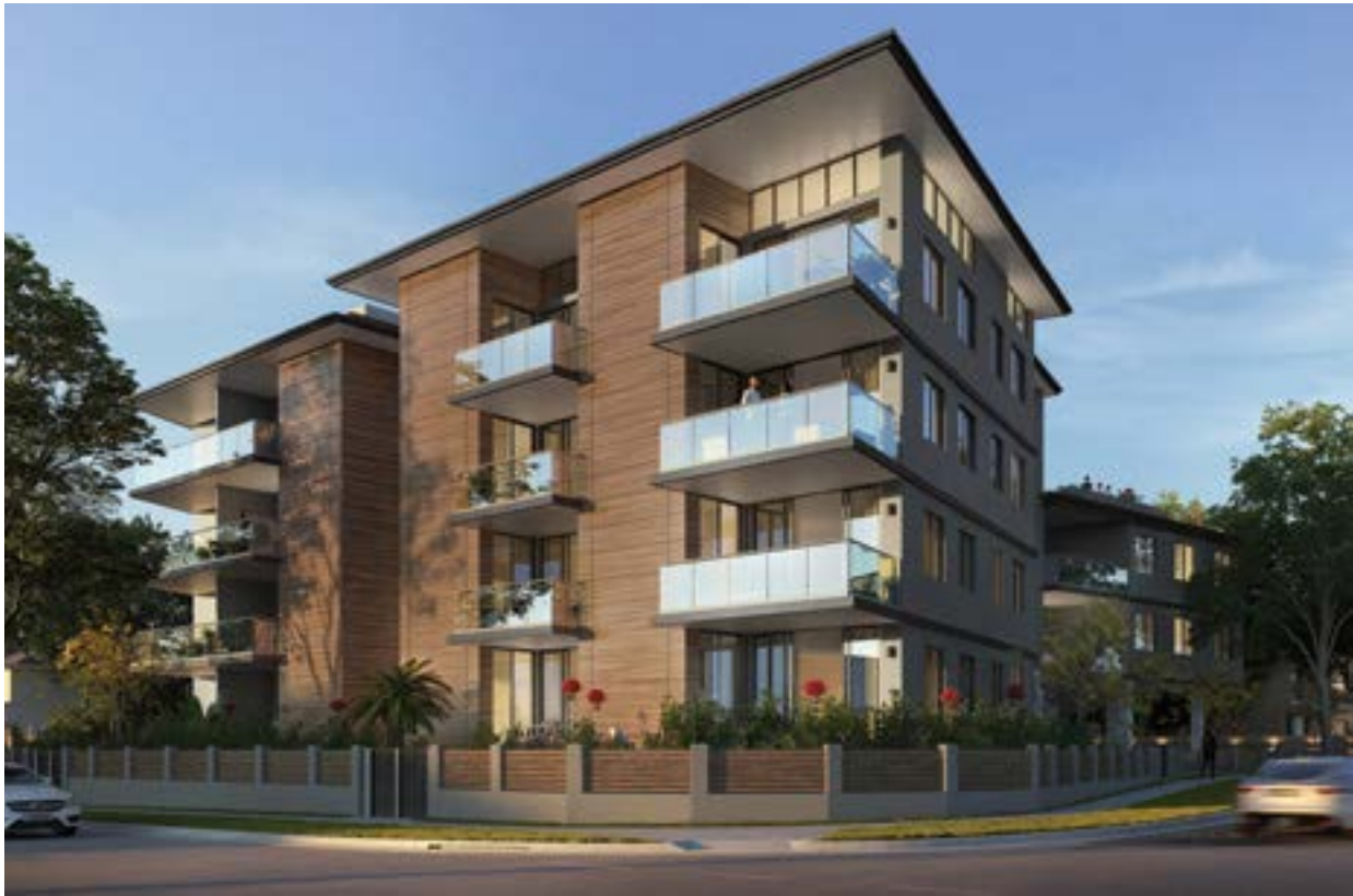
The Collett, Parramatta

Conquest is at the forefront of the industry, combining a passion for construction with a defined vision for maintaining the standards of excellence for which conquest have become renowned. As a construction manager, they manage all core building trades. Their extensive experience and broad areas of expertise allow Conquest to be an innovative and visionary with a focus on ensuring a quality project is always delivered.