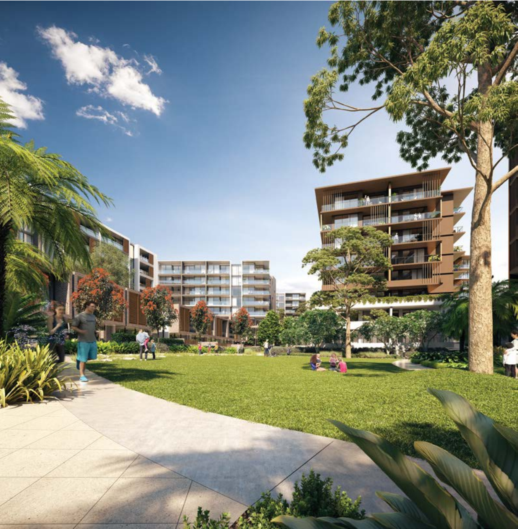
Villa de Ma III, Rouse Hill