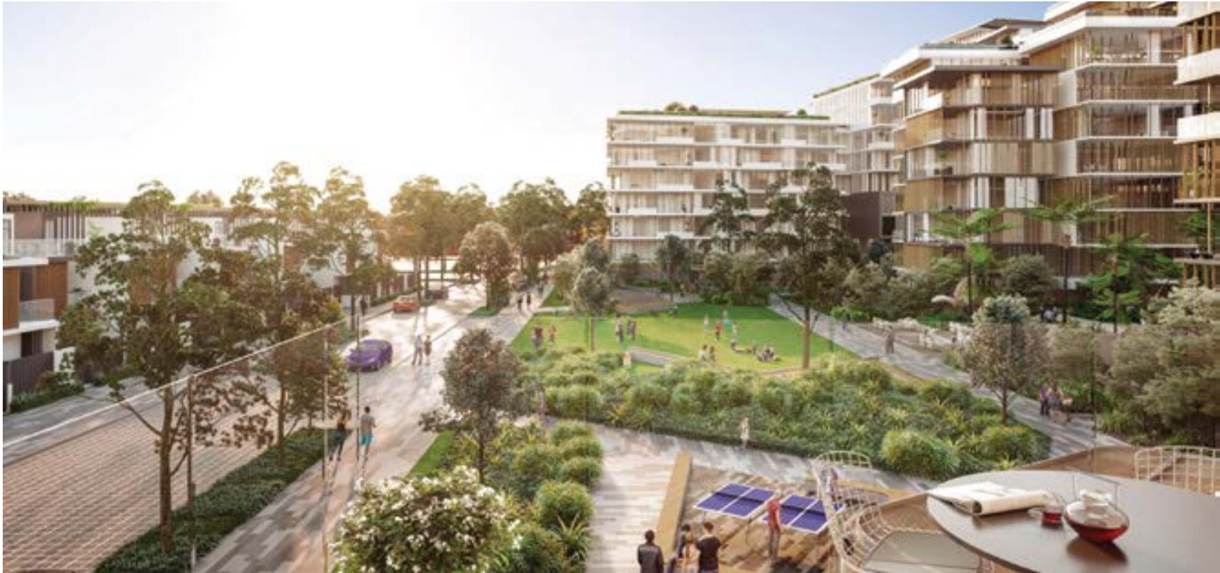
Ramsgate Park, Ramsgate

Arcadia Landscape Architects has a talented team of award-winning landscape architects and urban designers who thrive on creating spaces that connect people to the places they inhabit. Arcadia is a renowned landscape design studio who has gained wide recognition for their residential developments including the award-winning landscape design for “The Platform” building in the Carriageworks Precinct in North Eveleigh.